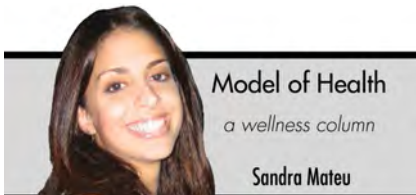
Model of Health a wellness column Sandra Mateu

I am always looking for new ways to improve my diet. Like most of you, I do not own a portable kitchen that goes with me from school to work, and then back home to follow the same routine day after day. I simply do not have the time to deal with that. I am always on the run trying to keep a healthy diet.