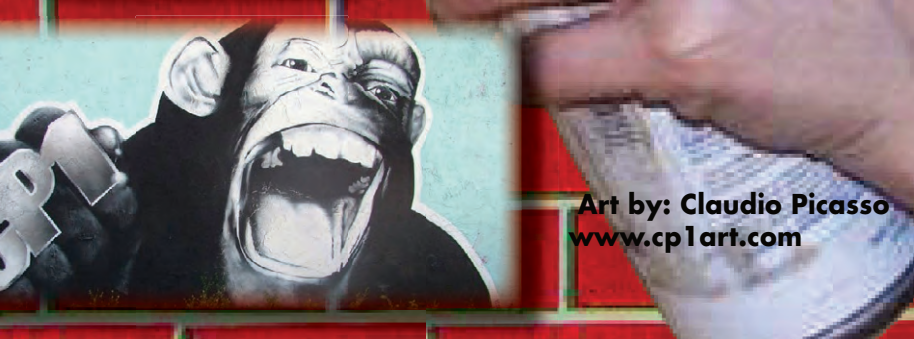
Art by: Claudio Picasso www.cp1art.com