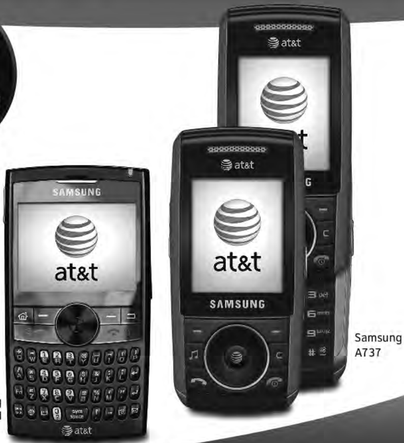
Samsung Blackjazz™ II