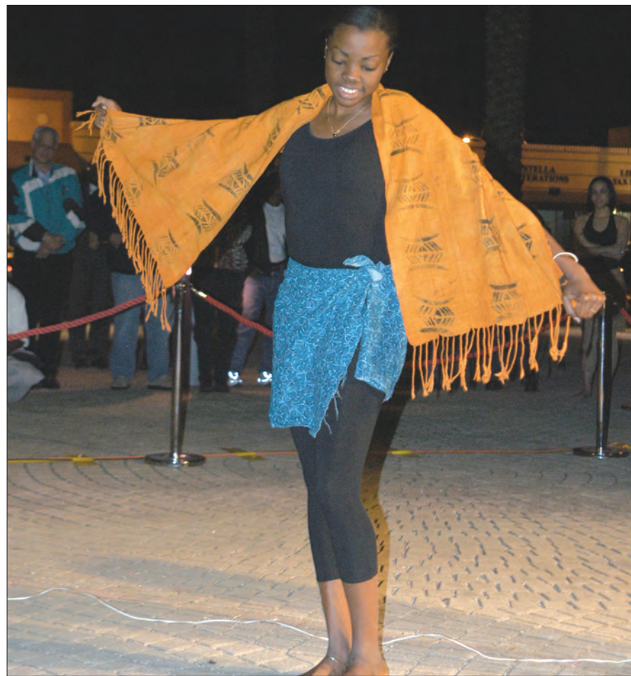
CELEBRATION: Students of FIU, Miami Dade College, Johnson and Wales, and Barry University gather at the MOCA Museum of Contemporary Art in North Miami to celebrate Martin Luther King’s birthday on Jan. 20. A student from Miami Dade participates in an interpretive dance inspired by the children’s book “The Giving Tree”.