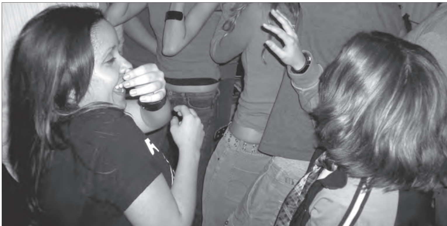
PARTY HARDY: When college students have so many other things going on, like partying and sleeping, who has time for class anymore?

When we do go to class, however, it’s always an interesting experience because the classroom is like a whole other world. You’re sitting in the back of a