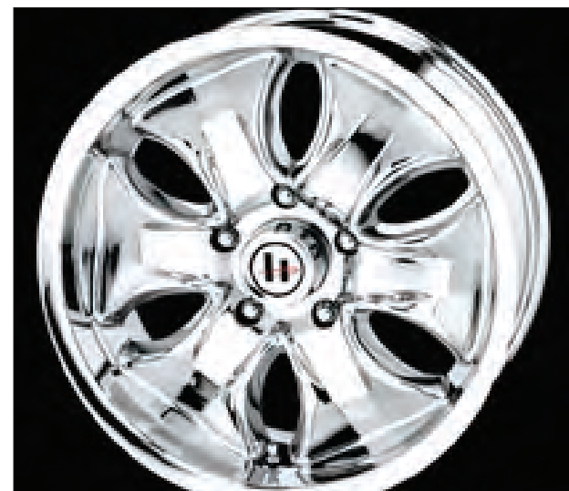
SPINNING IN CIRCLES: Many students find popular spinning hubcaps like these annoying and tacky.