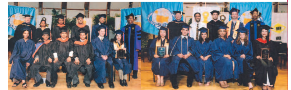
Fall 2004 graduates.