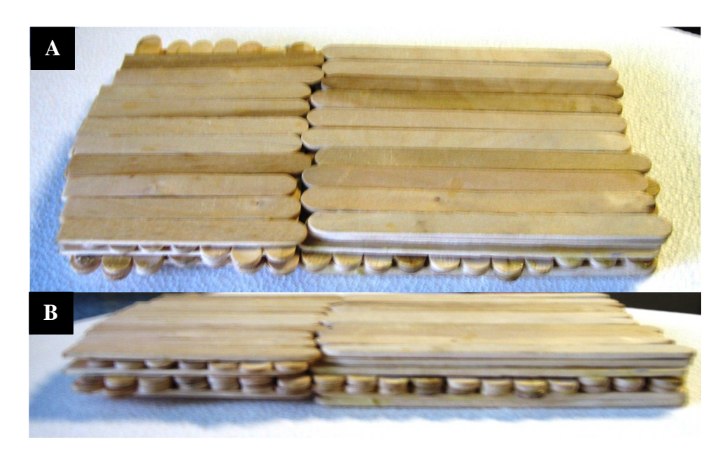
Figure 4. Student bridge that accommodated a 145 lb. load. Top view of bridge, B) Side view of bridge showing alternating 0° & 90° plies.

To conclude this project, students were not given a paper-based exam testing their knowledge of the subject as outlined in Step 5 of the learning paradigm. Due to the desired learning objectives, students were evaluated entirely on the functionality of their bridge design, and an end of the term group-presentation where they described their design, what they learned, and how and why their design failed. The bridge that each team built was tested for a maximum carrying load. Students learned that a design greatly influences the load parameter of measurement. One bridge built by a team accommodated a load of 145 lbs, which was the highest of all the teams (Fig.4A, 4B). This is particularly noteworthy, because this design was conceptualized and built by a single student whose team had abandoned the project mid-way through the assignment.