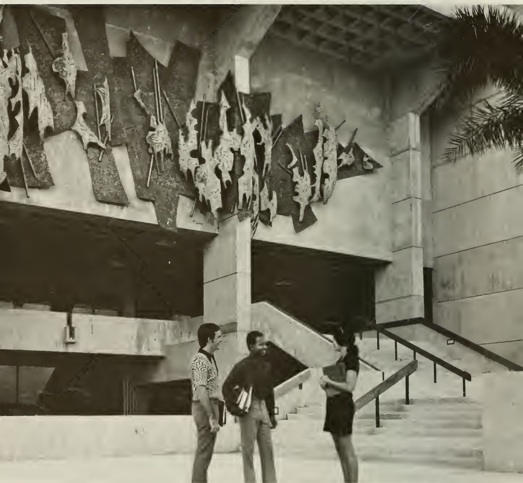
Student life begins at Primera Casa.