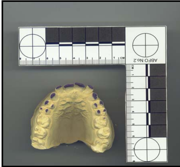
Figure 1: Scanned image of stone cast with American Board of Forensic Odontology scale No. 2 using flat bed scanner

with American Board of Forensic Odontology [ABFO] scale No. 2 to rule out any geometrical distortion while scanning and stored with proper labeling for identification [Figures 1, 2].