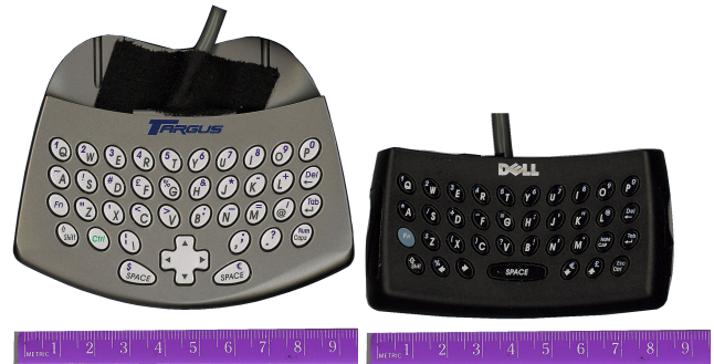
Figure 1. The mini-QWERTY keyboards used in our previous studies: Targus (left) and Dell (right).

Fitts' Law [2] is a performance model for aimed movement when users are experts at a given pointing task and cognitive overhead is not relevant. Silfverberg et al. used Fitts' Law to develop a model for expert text entry on a standard 12-key mobile phone keypad [6]. MacKenzie and Soukoreff proposed a similar model for two-thumb text entry on miniature keyboards [4]. They provide a general description of user/keyboard interaction and predicted an expert rate of