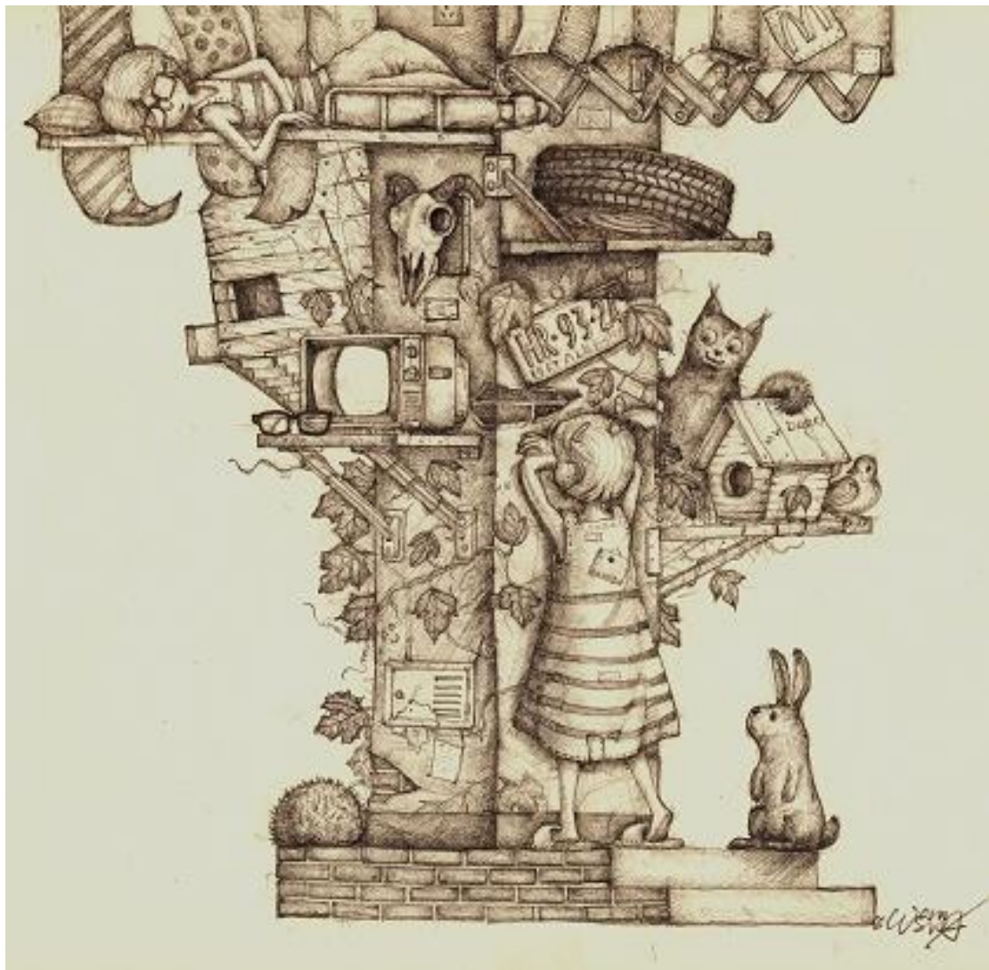
Illustration courtesy of James Wang