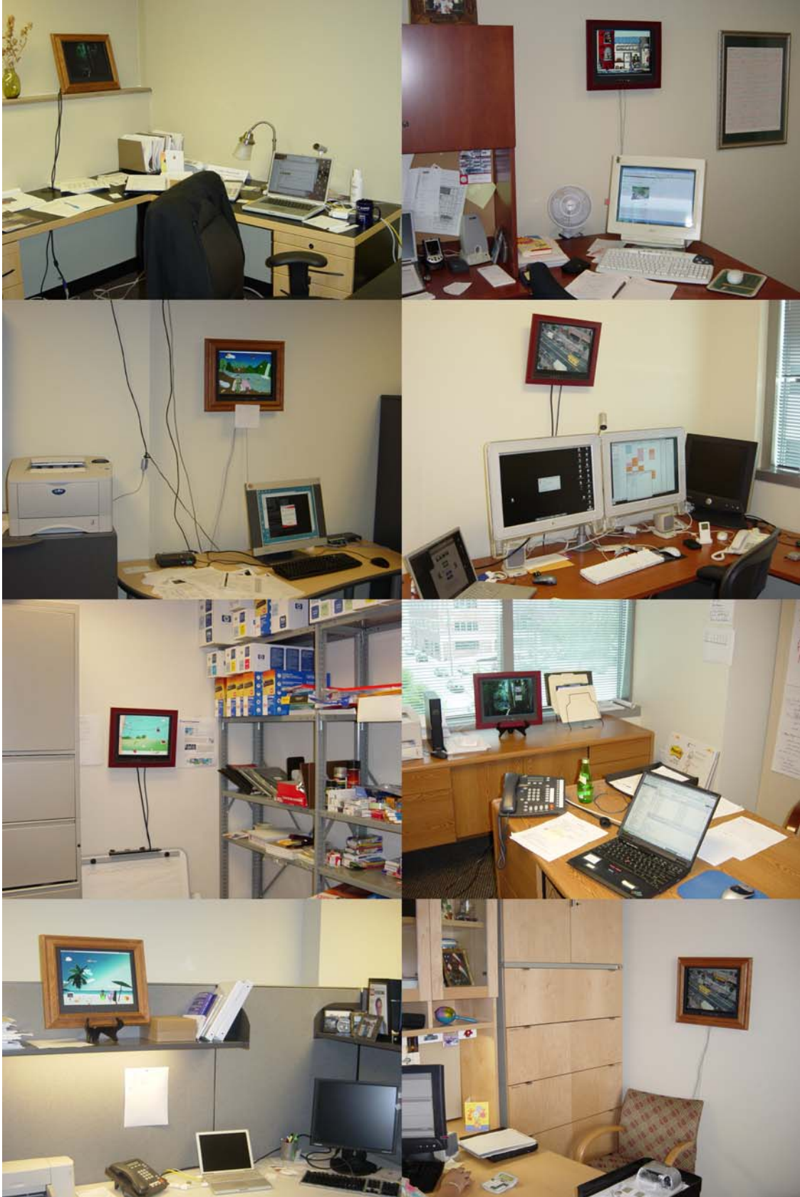
Figure 1. Views of the eight InfoCanvas deployments in the study, in participant order.