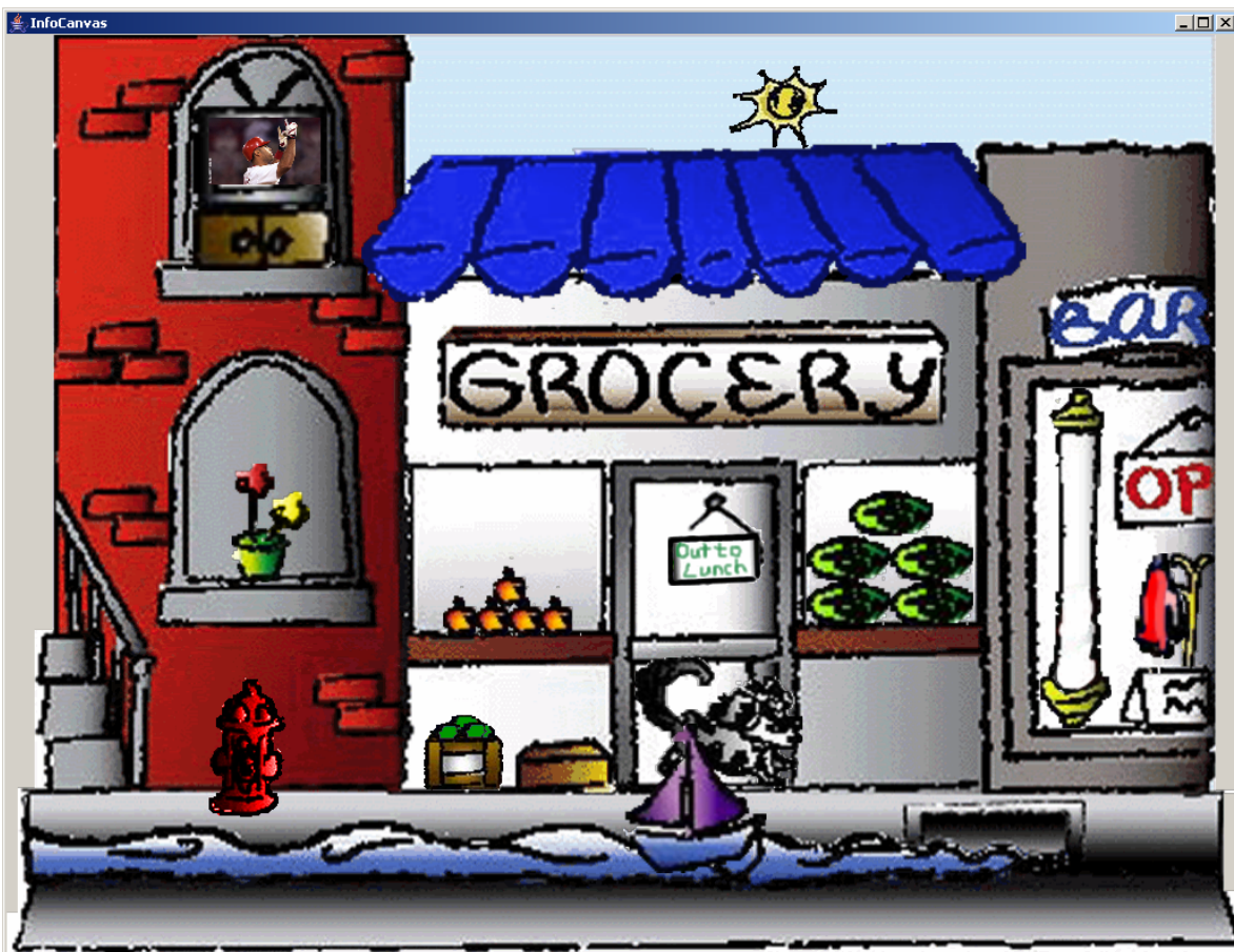
Figure 3. An example view from P2's IC display along with the set of mappings from information to visual objects.