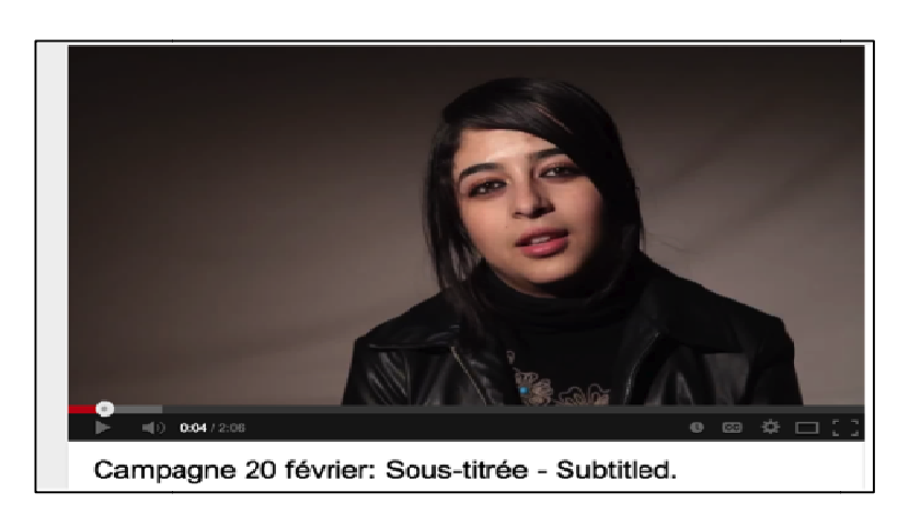
First Female Activist Speaking in the February 8th, 2011 Campaign Video for the February 20th Movement

By choosing to speak in a colloquial or 'rural' and 'feminine' language, these activists iterate their challenge to the current power structure in Morocco. From his crowning in 1999 to 2011, King Mohammad VI had never addressed the nation in Darija, choosing to use French or MSA. February 20<sup>th</sup> activists highlighted the government's suppression of these languages with their inclusive dialogue, posting in Berber, colloquial Darija, Modern Standard Arabic and French on their Facebook page and in the opening and closing sequence of their advocacy videos directed by the Moroccan male activist from Salé.