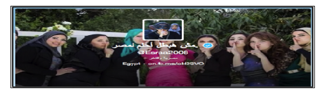
Esraa Abdel-Fattah's Twitter Profile @Esraa2008 with 328,000 followers.

Many Egyptian female activists realized the significance of their bodily presence and used their presence to challenge and rally Egyptian citizens. As founding members of the Egyptian April 6<sup>th</sup> protest movement<sup>48</sup>, Asmaa Mahfouz and Esraa Abdel-Fattah have interacted on all forms of media—Facebook, Twitter, YouTube, blogs, etc. International media sites such as Al Jazeera, BBC and Open Democracy dubbed Mahfouz and Abdel-Fattah "Facebook Girls," for their prolific online activism leading to the #Jan25 protest.