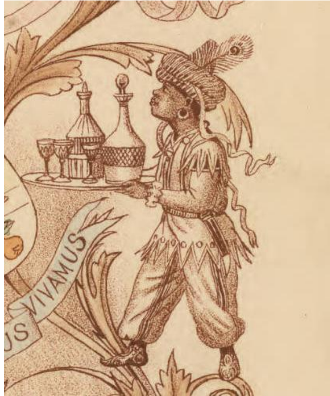
Figure 2: West Hotel menu, 1884

The waiter is looking up, locating him below the guest, echoing a master and slave hierarchy and reinforcing who is expected to serve and who is expected to be served at this hotel. Holding the tray softly and walking delicately, this image is the idealized invisible black servant. His softened facial expressions return to the earlier discussion of emotional labor: this waiter is performing a happiness or eagerness to serve, reassuring guests of the naturalness of his servility. Elaborated on in Chapter 3, southern slave-owners on vacation in Minneapolis brought slaves to Minnesota hotels in the early 1860s, just twenty years before this menu was published.