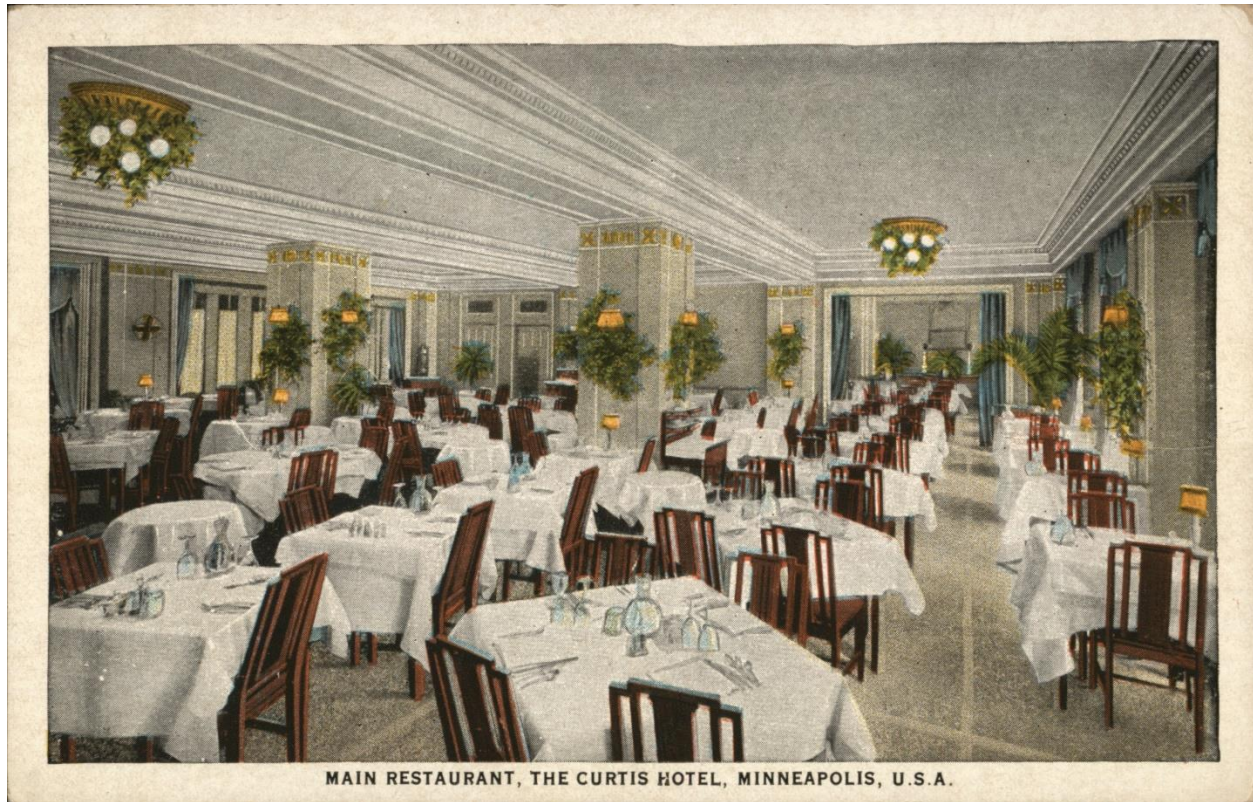
Figure 1: Curtis Hotel Postcard, circa 1940s

When members of the Hotel and Restaurant Employees International Union (HERE) gathered in Minneapolis at the Curtis Hotel for their biennial convention in the summer of 1934, the city was in the midst of a pivotal truck driver strike. Just weeks before the convention two strikers had been shot dead by Minneapolis police. Governor Floyd Olson declared martial law, deploying thousands of National Guard to the streets, arresting union leaders and seizing the Teamsters' strike headquarters. 1 At a session of the convention, four hundred striking truck drivers marched in, and to cheering delegates, HERE Secretary Robert Hesketh presented the