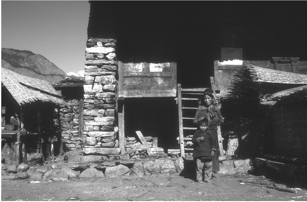
Figure 3. Geoff's hostess in 1984.