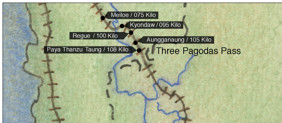
FIGURE 3.4. BURMA RAILWAY MAP #3. MEILOE—PAYA THANZU TAUNG.