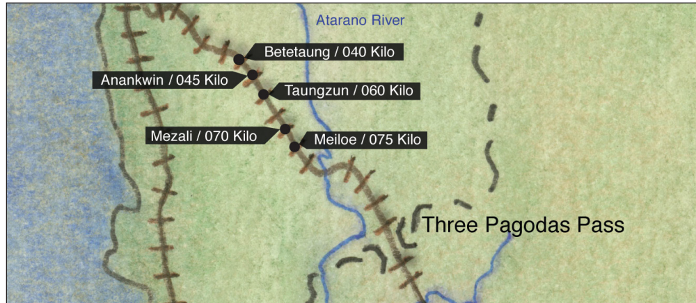
FIGURE 3.3. BURMA RAILWAY MAP #2. BETETAUNG—MEILOE.