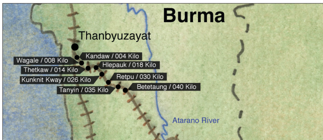
FIGURE 3.2. BURMA RAILWAY MAP #1. THANBYUZAYAT/000 KILO—BETETAUNG.