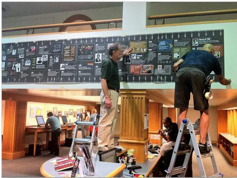
Z Smith Reynolds Library