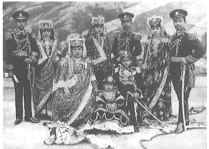
Chandra Shamsher's sons and their families