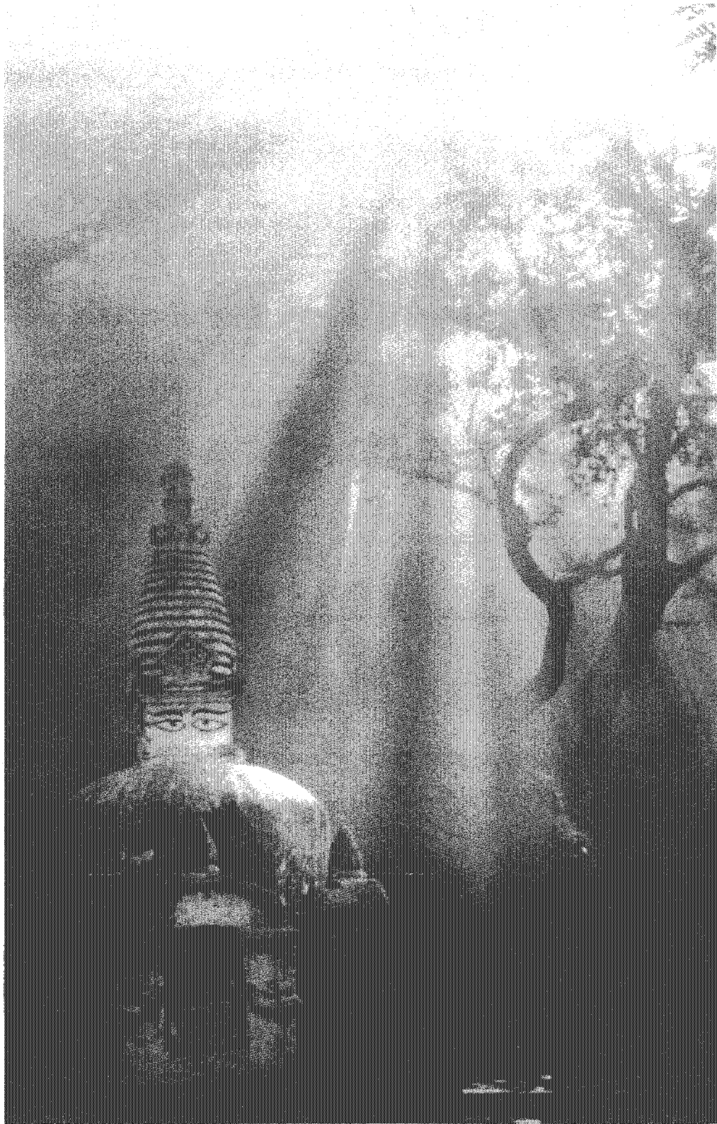
Stupa at Swayambhu