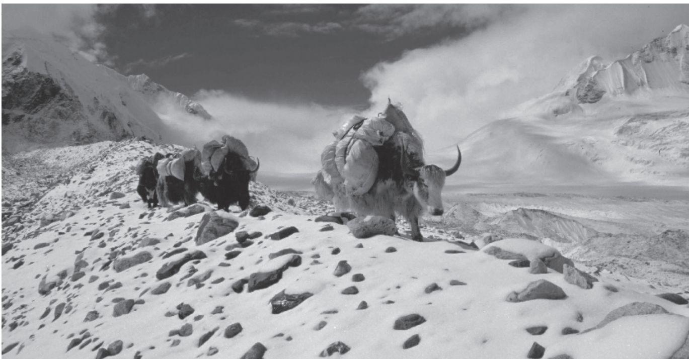
Yak train descending, Cho Oyu