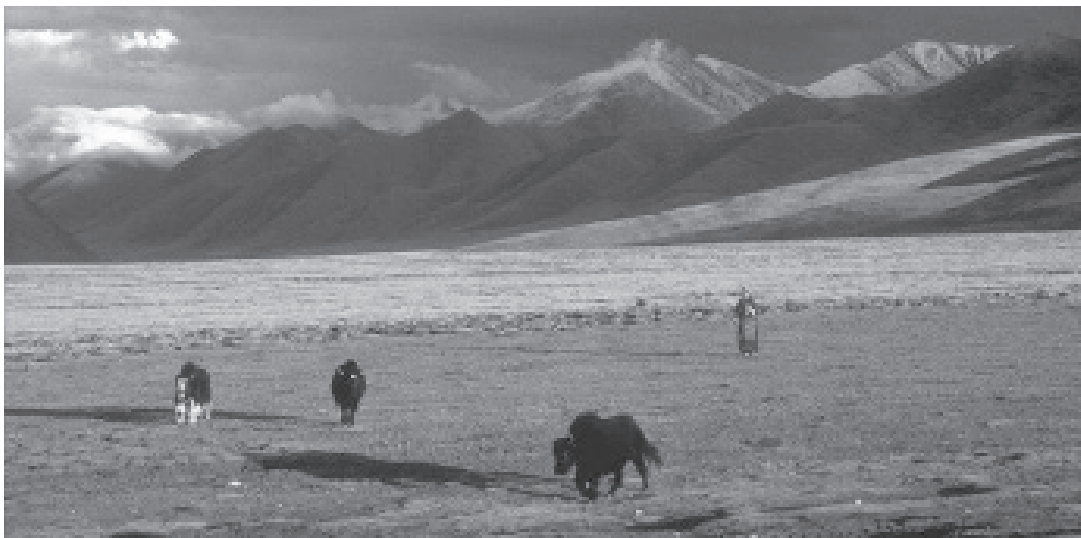
Rangeland with yaks on the Tibetan Plateau