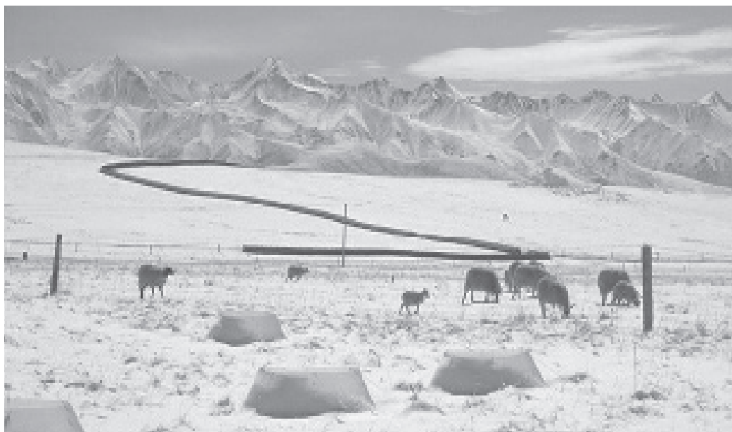
Experiment site under snow

There are two main habitats in the region: winter-grazed meadow situated along the valley floor, and summer-grazed shrubland situated on the higher slopes encircling