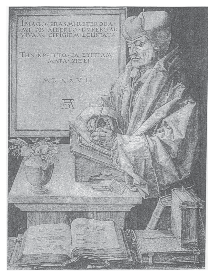
Figure 2. Albrecht Dürer, Erasmus of Rotterdam , 1526, engraving, Hood Museum of Art, Dartmouth College, Hanover, New Hampshire.