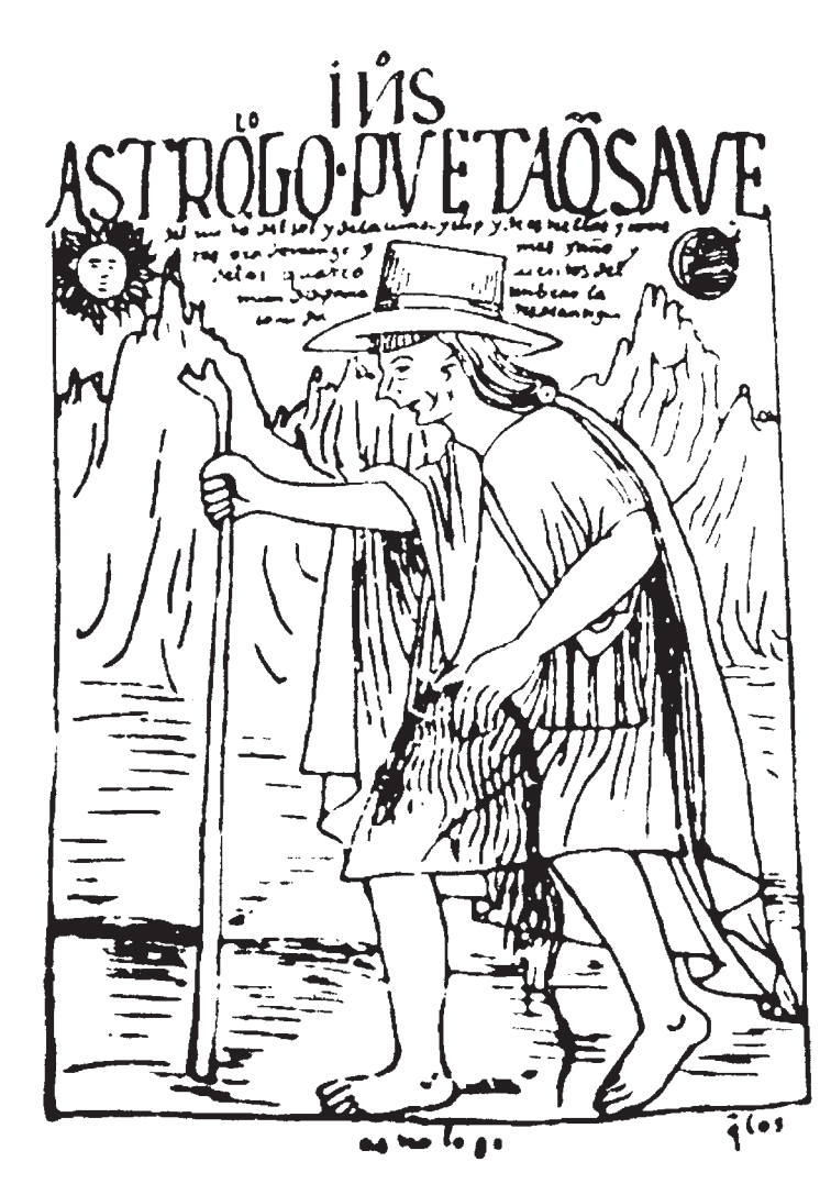
Figure 4. Guaman Poma's description of the astrólogo (amauta or philosopher) in an Inca cosmological setting, with the sun and the moon, the masculine and the feminine, as complementary opposites. He also carries a string of quipus, implement of the Inca writing system, within the same logic of the ceque system (Guaman Poma, Neuva corónica y buen govierno ). The drawing reveals the coexistence, as in "El Pontificial Mundo," of Spanish and Inca concepts of representation. This is a good example of what Serge Gruzinski analyzes as " mestizo thinking" (la pensée metisse). (From Serge Gruzinski, La pensée metisse . Paris: Fayard, 1999.)