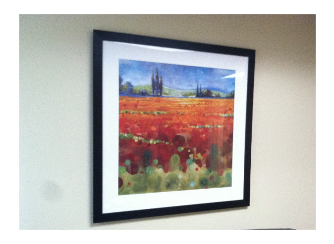
Experimental Room Design (Images are of Room A. Room B had similar features)