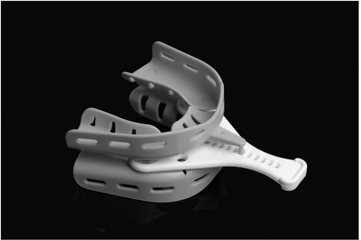
Fig. 1. Diagram of the intraoral device (EMA-T) used to advance the mandible The appliance consists of plastic trays for the upper and lower dental arches. A custom-fitted appliance was constructed for each participant by placing fast-setting dental impression materials in the troughs of the trays. When the appliance was in place, the mandible was manually advanced by securing a peg in the projection from the upper tray into one of the holes in the projection from the lower tray.