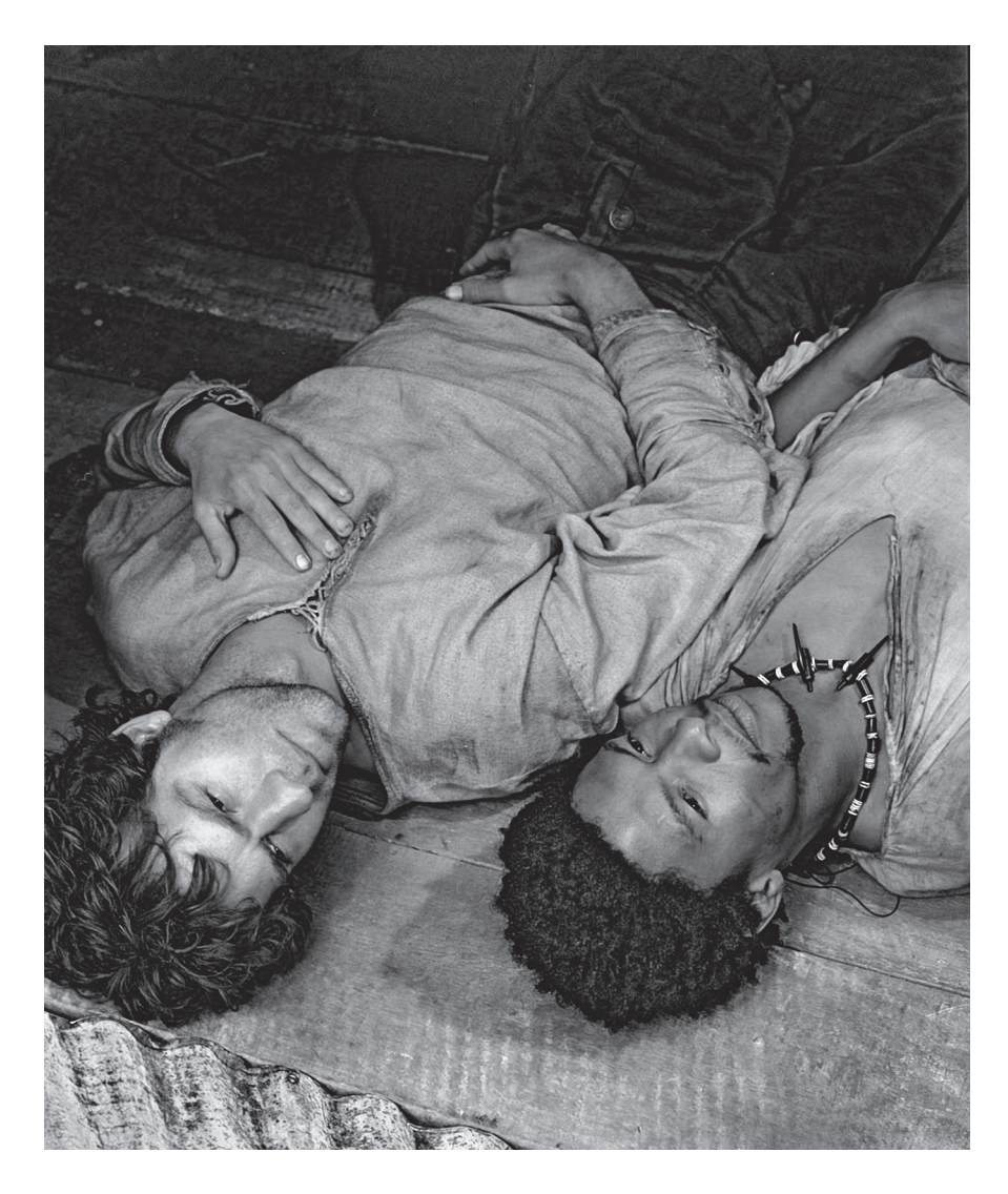
Figure 1. Class and Rijkhaart, taking a break from manual labor in the slate quarry on Robben Island, share a bottle pipe of dagga (weed).

Noa Ben-Asher : Overall, the film is cynical about academic attempts to historicize sexualities. In the opening scene, for example, as the 1950s-style ladies with typewriters try to translate fucking , they criticize themselves for being too modern, too contemporary. I think the film critically locates the viewer's relationship to sodomites as "premodern homosexuals," in parallel with the Dutch colonizer's determination to give scientific names to African plants and races. When we try to understand how the "modern homosexual" came about, we are engaged as voyeurs