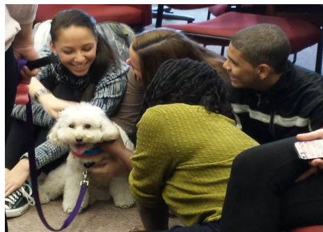
Bailey, a Cockapoo, visited with students at the Birnbaum Library in October.

After a great visit in October during midterms, students at the Pace Libraries will once again get a chance to relieve exam anxiety with our friends from the Good Dog Foundation. The dogs will be at the Mortola Library (PLV campus) on Tuesday, December 3, from 10 am to 1 pm, and at the Birnbaum Library (NYC campus) on Tuesday, December 10, from 3:30 to 4:30 pm. Make sure to arrive early since these fuzzy friends are very popular!