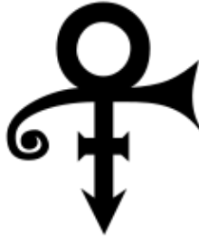
Figure 4. The Prince Symbol. 47

Ironically, in 1999, the musician Prince found himself not so much partying, 45 but instead defending himself against a copyright infringement claim in the Seventh Circuit. The case of Pickett v. Prince 46 involved an electronic guitar designer who incorporated the Prince symbol into the design of the body of a guitar.