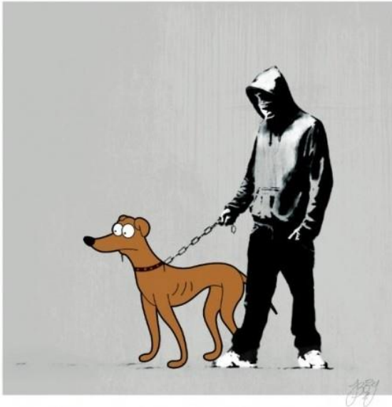
Figure 3. Very Little Helper, J-Boy 6

sons), 4 another street art collective under the moniker J-Boy created a piece of urban art entitled “Very Little Helper,” 5 a variation featuring only the Banksy hooded character walking Santa’s Little Helper, the family dog from the classic television show The Simpsons . Note that J-Boy’s creation does not use the Haring dog or any expression from the original work in the chain.