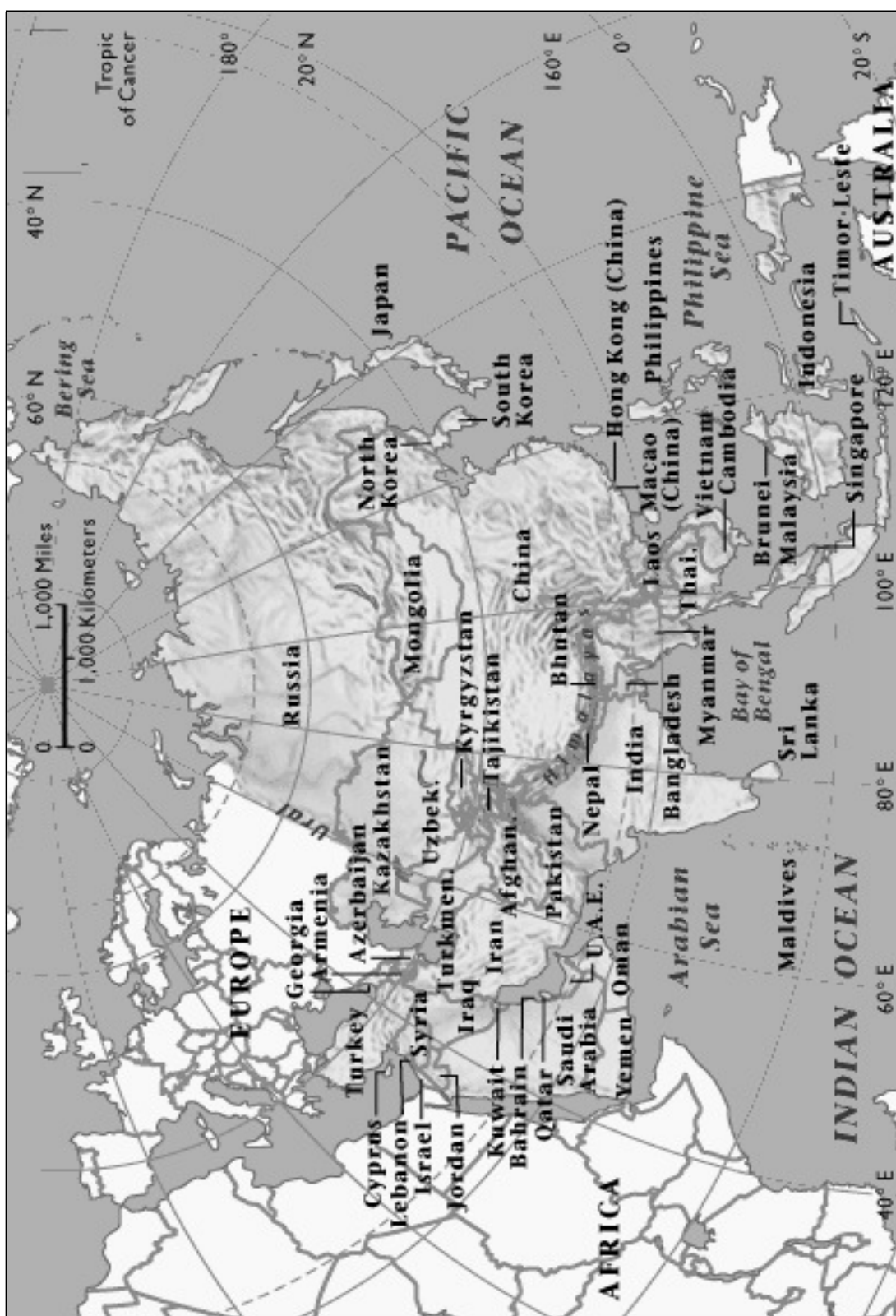
Map 1: China and Her Neighbors in 2007