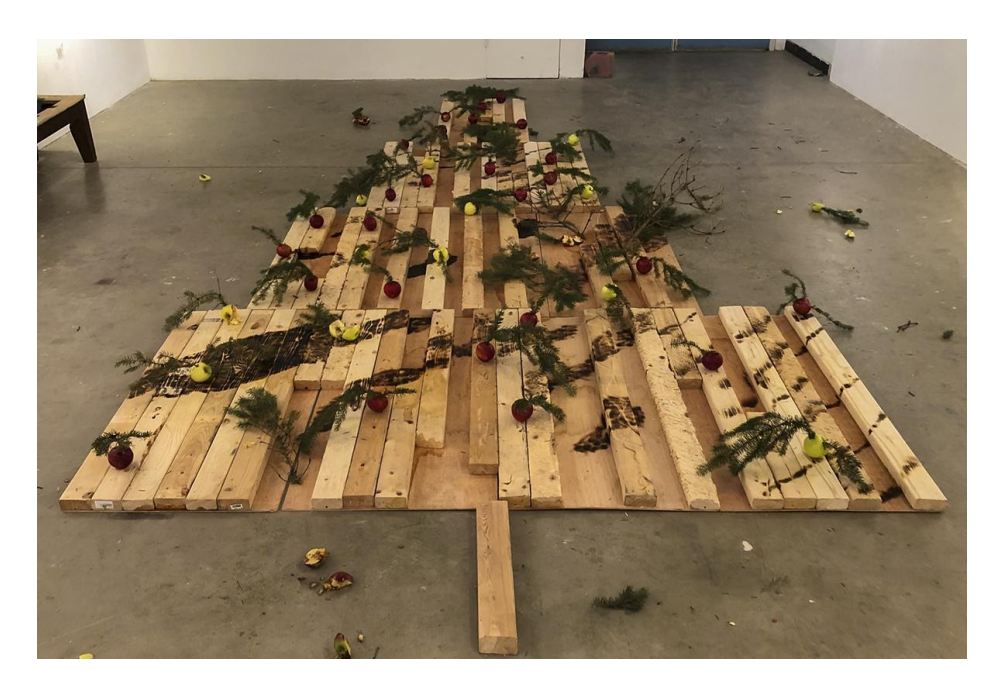
PineApple Tree, (2020)

to rot on the gallery floor like a fallen tree. From the 2x4s, I constructed the rough silhouette of a tree to lay upon the ground acting as a platform for the pun - directly translated from the apples and pine branches - and gives a visual weight and importance to the PineApples.