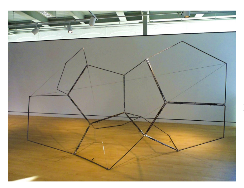
Connections , (2017)

As an object maker the perception of value in my work has fluctuated over time. I don't mean the value in making objects, but the question of what is driving my research. When I began my graduate research I was enamored with finely crafted large scale sculptures and objects. Connections (2017) was the culmination of my undergraduate research and ideas of space and