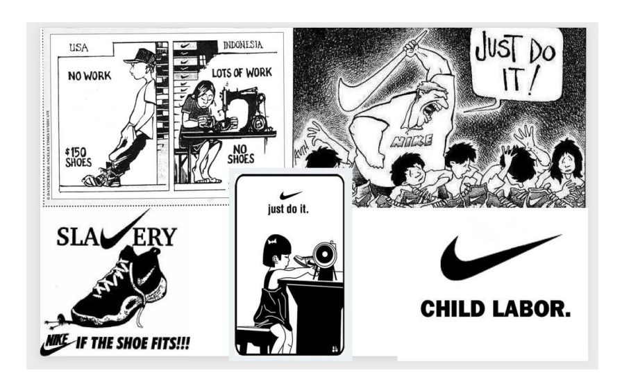
Figure 4 Contemporary images used in Gwen's Child Labor Unit

Gwen reported that after some class discussion, she asks students to reflect further by responding to the writing prompt: "Would you buy clothing made in Indonesia knowing that you are supporting child labor? Why or why not?" Gwen's prompts allow her students to examine their personal relationship to child labor. As Grant (2013) makes clear, there is an enormous difference between using questions to check for student understanding and "using questions to frame a teaching and learning inquiry" (p. 325).