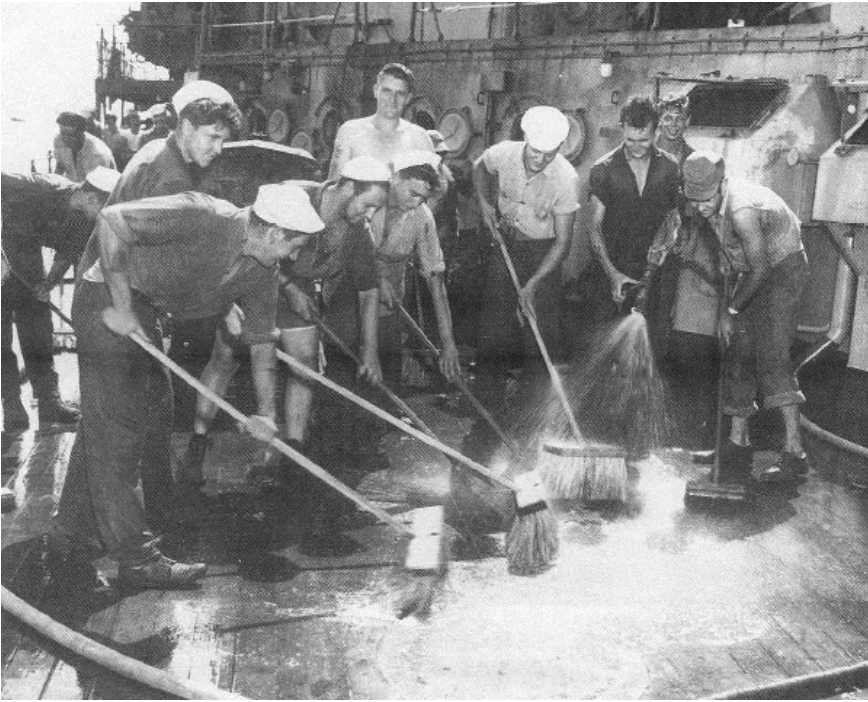
Sailors scrubbing down the German cruiser Prinz Eugen with brushes, water, soap, and lye. Five months later, the ship was still too radioactive to permit repairs to a leak, and she sank.

But the cost which can never be calculated is the power of those images upon the human imagination and fear, as well as their effect on the nuclear arms race. Many target ships, while damaged, survived Crossroads Baker, but were enveloped in so much radioactive seawater that decontamination became almost impossible, except for a few vessels.