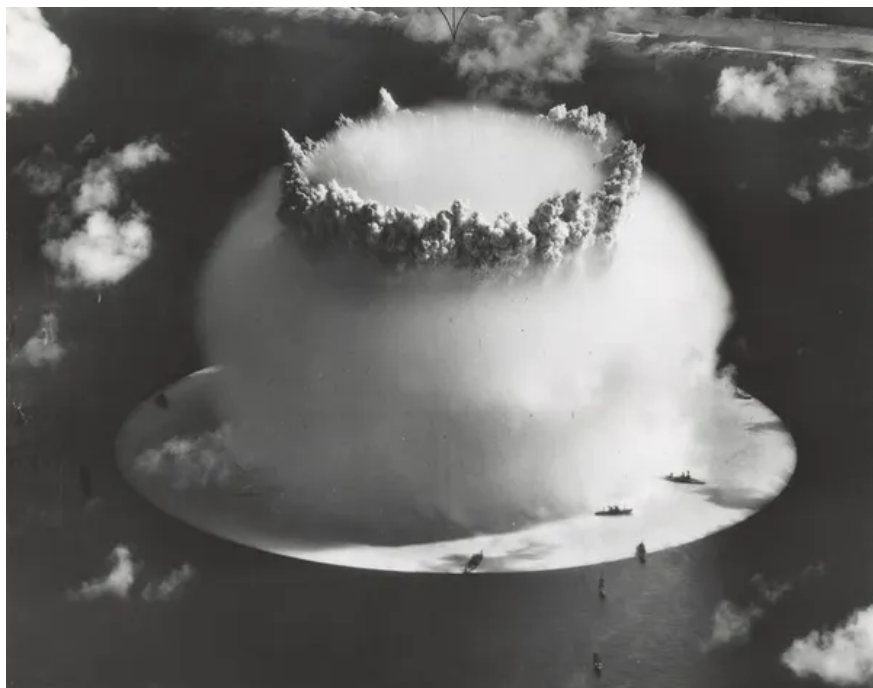
Crossroads baker nuclear explosion and the target ships around it, as seen from an aircraft camera, 25 July 1946.

Many of those iconic images which originally stunned me came from the aptly named Operation Crossroads – an exercise 75 years ago involving the first postwar nuclear weapons tests in July 1946, conducted by a joint US army-navy task force in Bikini Atoll in the Pacific. It involved 42,000 people, around 150 support vessels and over 90 target ships and submarines.