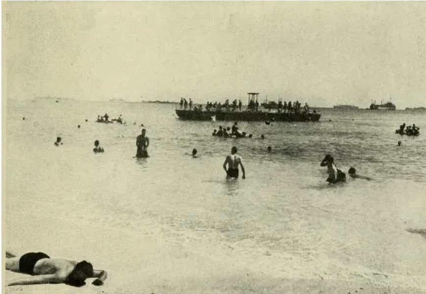
Photo from The Official Pictorial Record captioned: 'On the beach at Bikini, men of the Task Force try out the swimming facilities'. Operation Crossroads: The Official Pictorial Record

Crossroads had a book as well: an “Official Pictorial Report”, something not repeated in any other test series and publicly available with around 200 photographs and captions. It has been a very valuable and often-overlooked time capsule of how the test was recorded and presented, but is also only a drop in the lagoon of 50,000 still images captured.