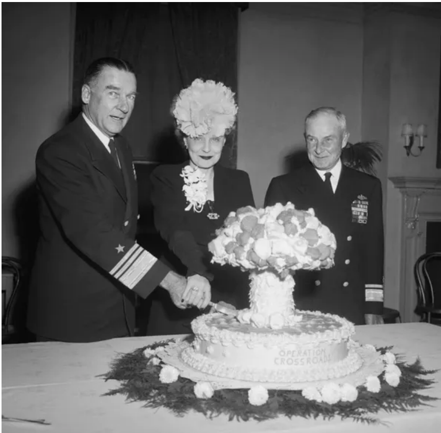
Admiral William Blandy, who led Operation Crossroads, and his wife cut a mushroom cloud cake.