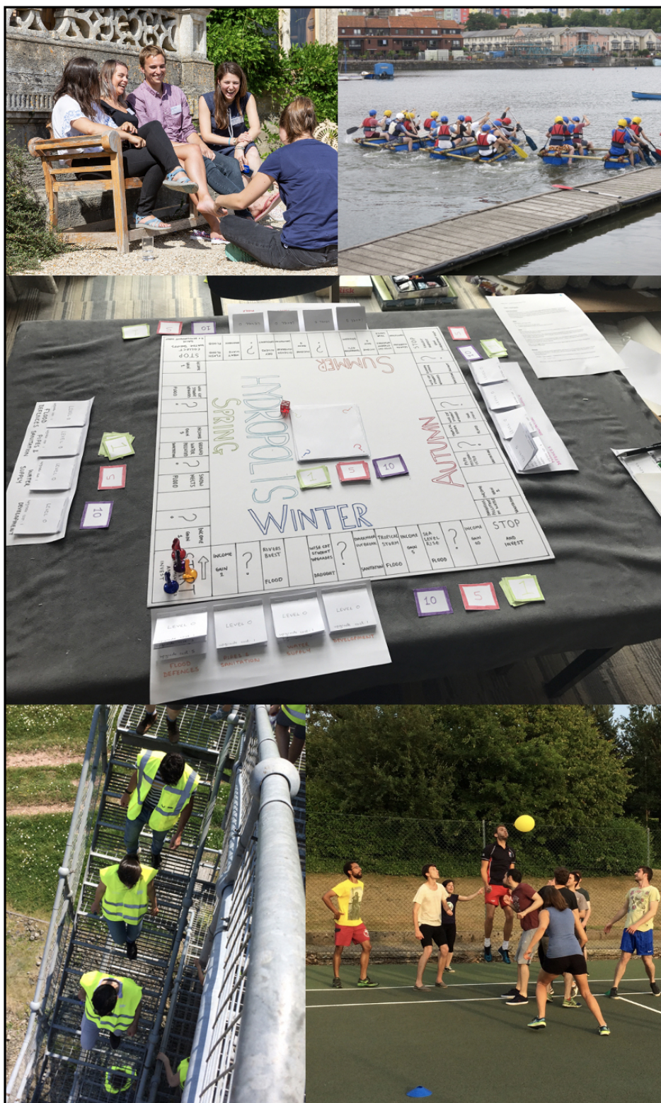
Figure 3. Examples of summer school activities.