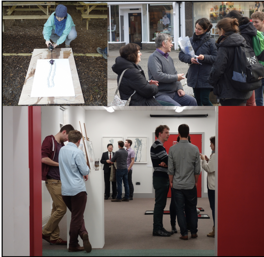
Figure 6. The Land of the Summer People art project paired each group of three PhD students with an artist. Each group independently developed a piece of art. Pieces included paintings, stone masonry and flood survival kits to be handed out to the public.