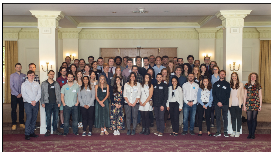
Figure 2. WISE CDT PhD students (summer school in Torquay, UK, 2019;).