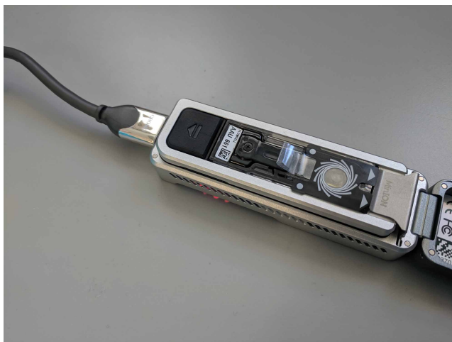
Figure 4. MinION sequencer with Flongle flowcell adapter and mini flowcell fitted. Also shows USB connection which allows the device to be run from a laptop.

deployment to cell-free systems (Figure 5B). This has the distinct advantage of not requiring the use of genetically modified organisms beyond the laboratory [97].