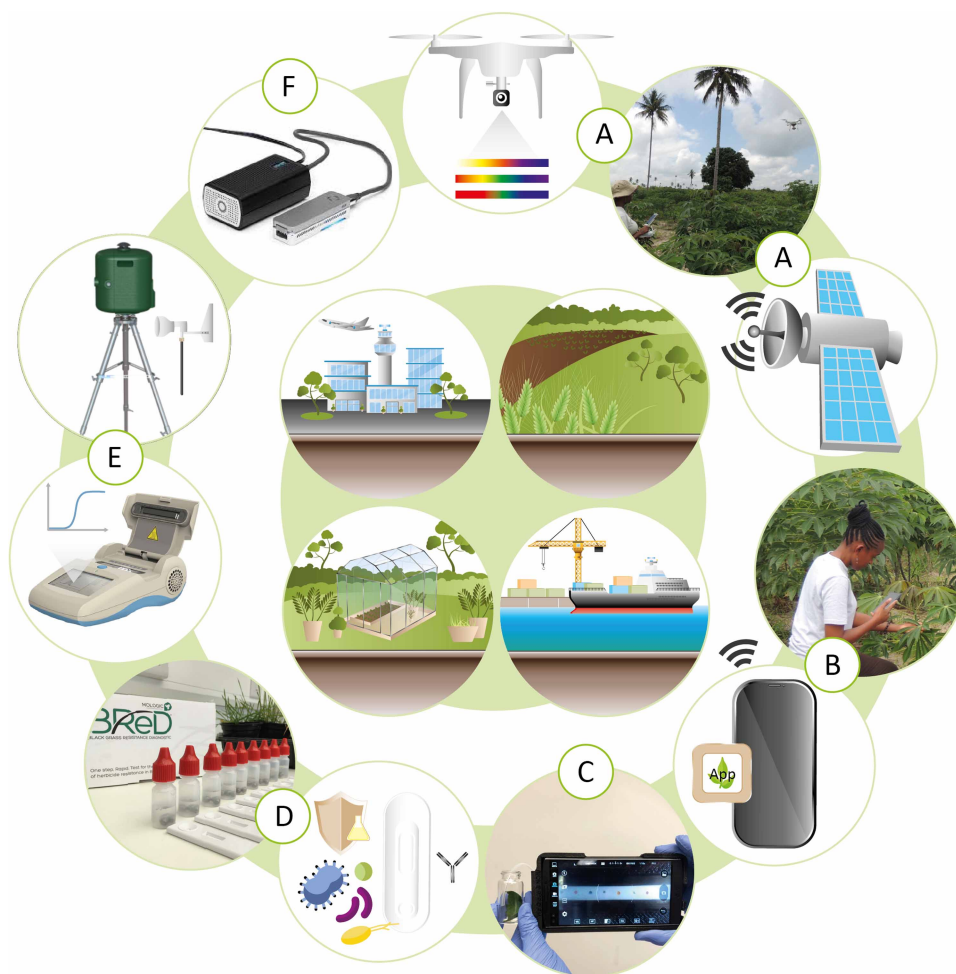
Figure 6. Integration of different technologies to support plant biosecurity and surveillance.

Centre: two main scenarios are represented; biosecurity (port and airport) and in-field surveillance (glasshouse and field). The technologies represented are (A) remote sensing; (B) smartphone-based detection; (C) plant VOCs detection; (D) LFA detection of proteins, (E) targeted and automated DNA detection and (F) High-throughput sequencing technologies.