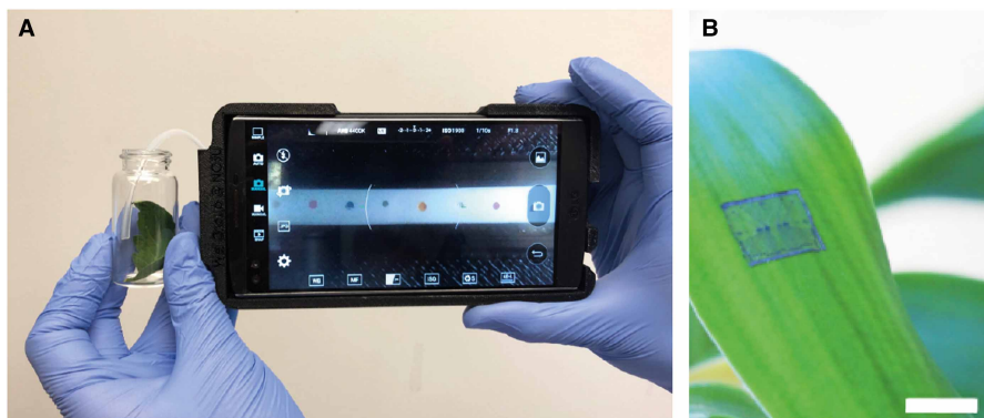
Figure 2. Miniaturised sensors enable in-field detection.

(A) A smartphone-based VOC sensor for early detection of late blight ( P. infestans ) and differentiation of early blight and Septoria leaf spot on tomato [65]. (B) A carbon nanotube-graphite-based wearable sensor transferred onto the surface of a live leaf [70].