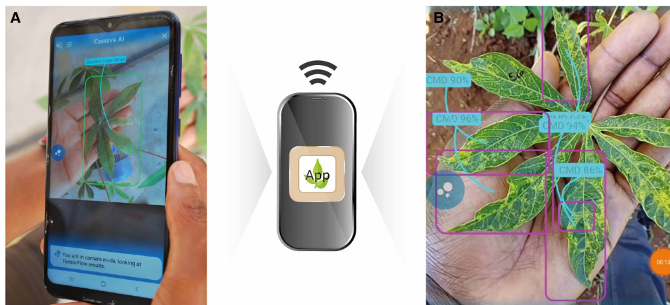
Figure 1. Smart phone applications facilitate wider access to diagnostic tools.

Example of the application of the PlantVillage Nuru App for identification of (A) cassava green mites and (B) Cassava mosaic disease (CMD) in cassava leaves.