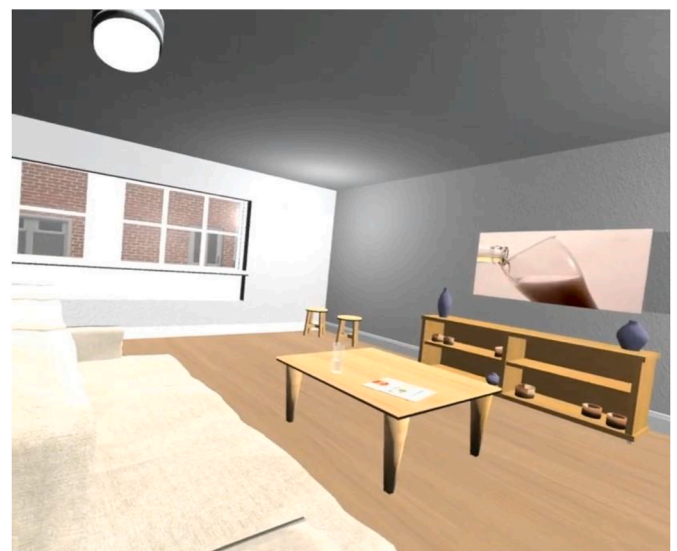
Fig. 1. Home VE - Living room & TV advertisement of alcohol.

For each VE of the A-PLAN app, a YouTube video was recorded with the first author navigating each VE for approximately 2–3 min. The videos were recorded in a first-person perspective to clearly present the view that participants would have if they were to be immersed in the VEs themselves, via a VR headset. Participants thus experienced the navigation within the environments as if they were the VR users. The video of the home VE (YouTube link: https://youtu.be/7nxbnqNoz5c ) involved standing in the living room and watching an alcohol TV advertisement, grabbing a supermarket leaflet with drinks offers and navigating within the living room. The video of the supermarket VE (YouTube link: https://youtu.be/fhl21Nd-IhQ ) involved navigating the alcohol aisle while observing a variety of drinks and grabbing a vodka bottle. The video of the pub VE (YouTube link: https://youtu.be/j55fSGXHPnU ) involved standing at the bar and being offered a pint of