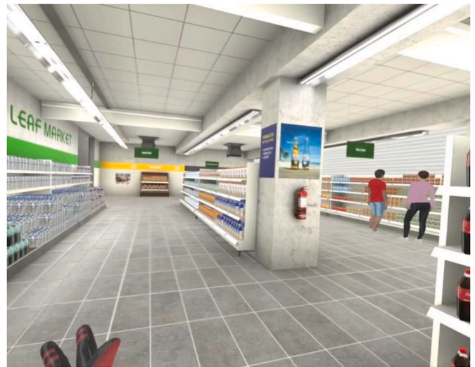
Fig. 10. Supermarket VE - Customer virtual agents.