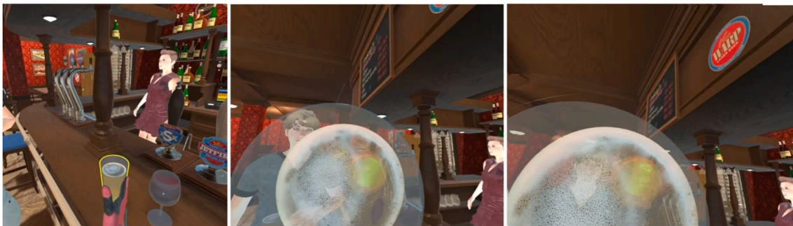
Fig. 15. Pub VE - Action of drinking beer pint.