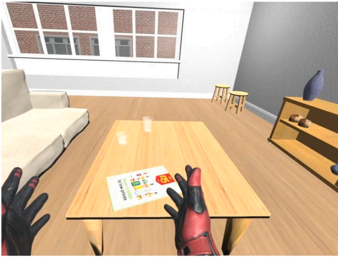
Fig. 2. Home VE - Supermarket leaflet with drinks offers.