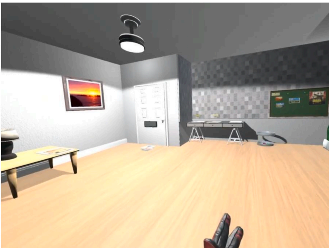
Fig. 4. Home VE - Entrance.