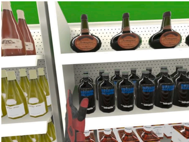
Fig. 8. Supermarket VE - Grabbing the vodka bottle.