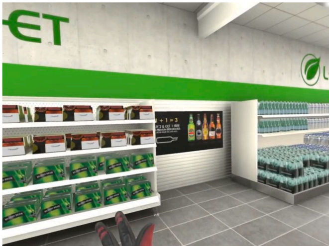
Fig. 9. Supermarket VE - Multi-buy drinks offers.

fast-paced movements to cause cybersickness - symptoms such as nausea, eye tiredness and, in rare cases, vomiting (Kim et al., 2020; Stanney et al., 2020).