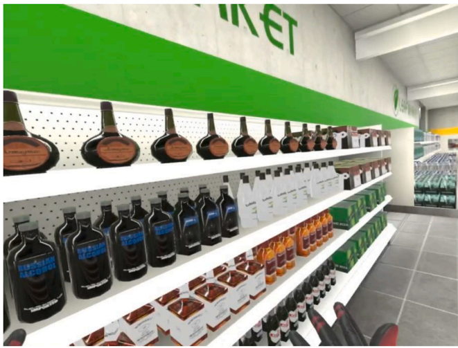
Fig. 7. Supermarket VE - Spirits section.