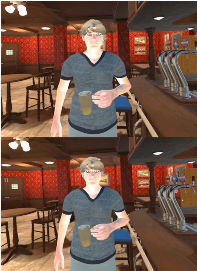
Fig. 12. Pub VE - Customer virtual agent.