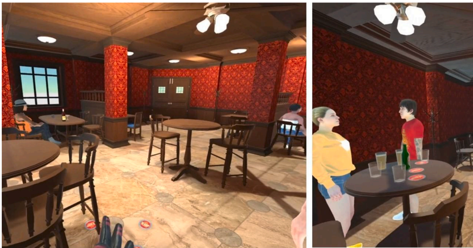
Fig. 14. Pub VE - Pub layout & customer virtual agents.