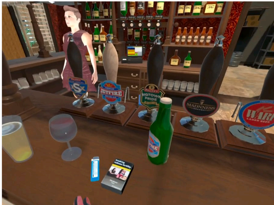
Fig. 13. Pub VE - Lighter & pack of cigarettes, & the bartender virtual agent.

The audio recordings produced by the interviews were transcribed verbatim and anonymised. Interview duration ranged from 40 to 80 min. After the interview, compensation was given for taking part in the study and a participant debrief sheet was emailed to the participants with contact details of organisations that could help if they felt any level of distress or if they were concerned about their drinking.