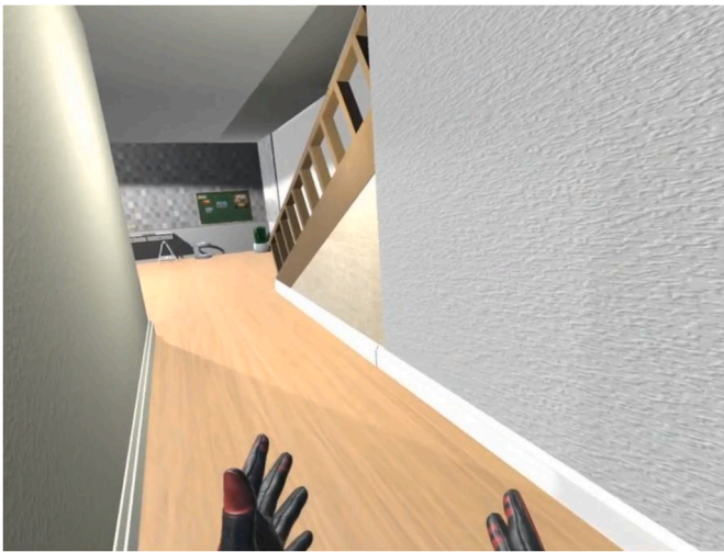
Fig. 3. Home VE – Hallway.