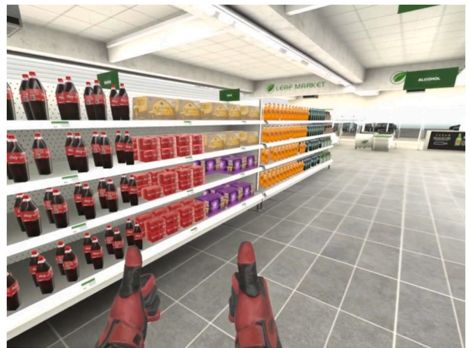
Fig. 11. Supermarket VE - Soft drinks section.