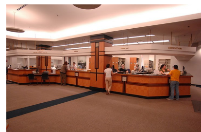
Loyola New Orleans Learning Commons

Student and faculty support services also play a central role in a Learning Commons. In the past, support services were often viewed as disparate operations. Libraries offered library support, technical services offered technology support, tutoring offered tutorial help and so on. In a 21 st century university, the lines between these supporting roles are blurred and are now often viewed as complementary to one another. A librarian helping a student with their research often finds that student needing writing support. A Writing Center tutor often encounters a student needing technical assistance. A technologist helping a user with their laptop may find them needing research help. The frequency of these crossovers is addressed in a Learning Commons by situating support services in close proximity to one another in a services zone so as to provide more seamless help for users. Services often found within a Learning Commons are library help, technology support, Writing Centers, Tutorial Services, faculty support services, and sometimes an “open” support area for services that may only be needed at certain times during the semester (i.e. Registrar or Student Activities.) By bringing these support services in closer proximity, students find much more in the way of a “one stop shop” for their academic support needs.