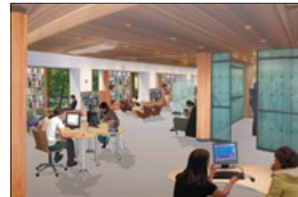
Image from conceptual design plan