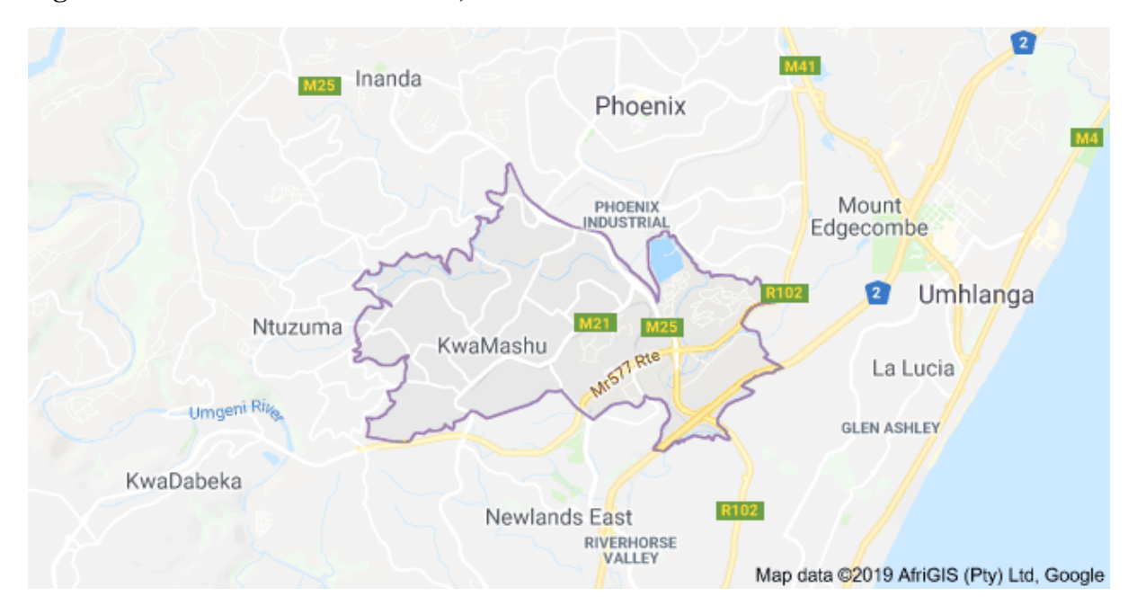
Figure 3.1: Location of KwaMashu, Durban

population (173,568) followed by Asians (1,457), and coloureds (303), with other groups and whites in the minority (145) (City Population, 2013).