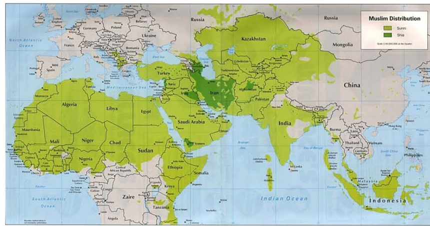
Figure 2: Worldwide Muslim Distributions

As Table 1 clearly demonstrates, the degree of Islamic practice within predominantly Islamic states varies widely, not to mention the type of Islam practiced. Nor is coverage of OIC membership completely correlative with predominantly Muslim states: Algeria, which is not an OIC member, has a Muslim population of 99%. 12 While geographic dispersal loosely tracks OIC membership combined with practicing population statistics per state (see map below), diversity among Islamic states is widespread, creating a heterogeneous mosaic of states as opposed to a monolithic “civilization” as Huntington might argue. 13