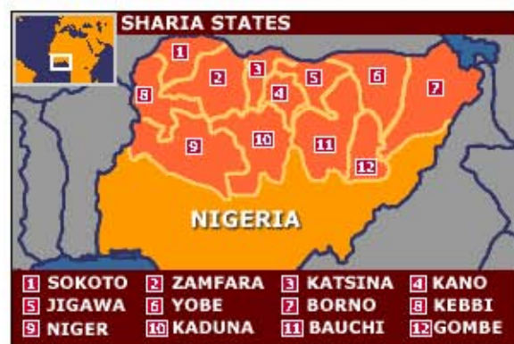
Figure 2: Northern States of Nigeria (BBC News)

Between January 2000 and April 2002, twelve northern Nigerian states introduced the criminal aspects of Shari'a, set up Shari'a courts and adopted Shari'a penal codes conforming to the Malikite school. Thus, Nigeria now has dual criminal justice systems that nevertheless feed ultimately into a Supreme Court, albeit after passing through dual appellate processes en route . 70