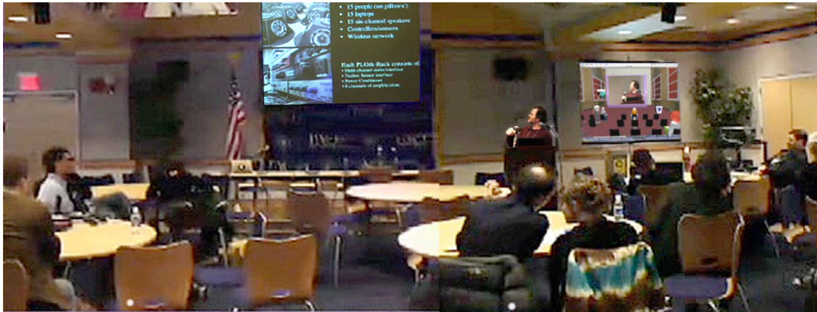
Multi-purpose Room, 1 Pace Plaza