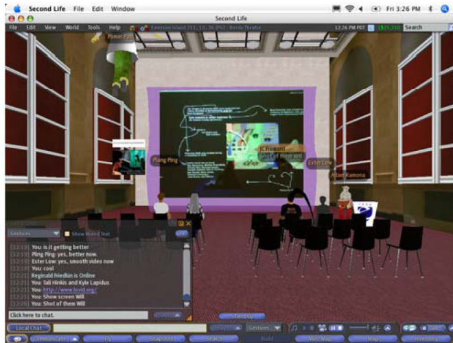
Bordy Theater Emerson College Island. Boston