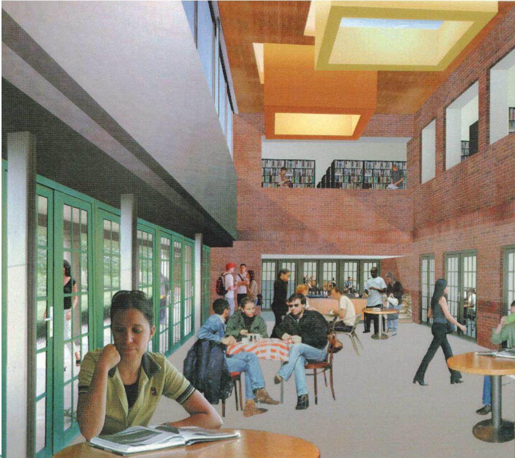
A View of the Proposed Courtyard Café as envisioned by Perry Dean Rogers & Partners.

give feedback? Do your learning spaces enable learners to work together to address real-world problems, interact with people and information outside the classroom, debate, research, inquire, and solve problems, engage in simulations, virtual field trips, role playing?"