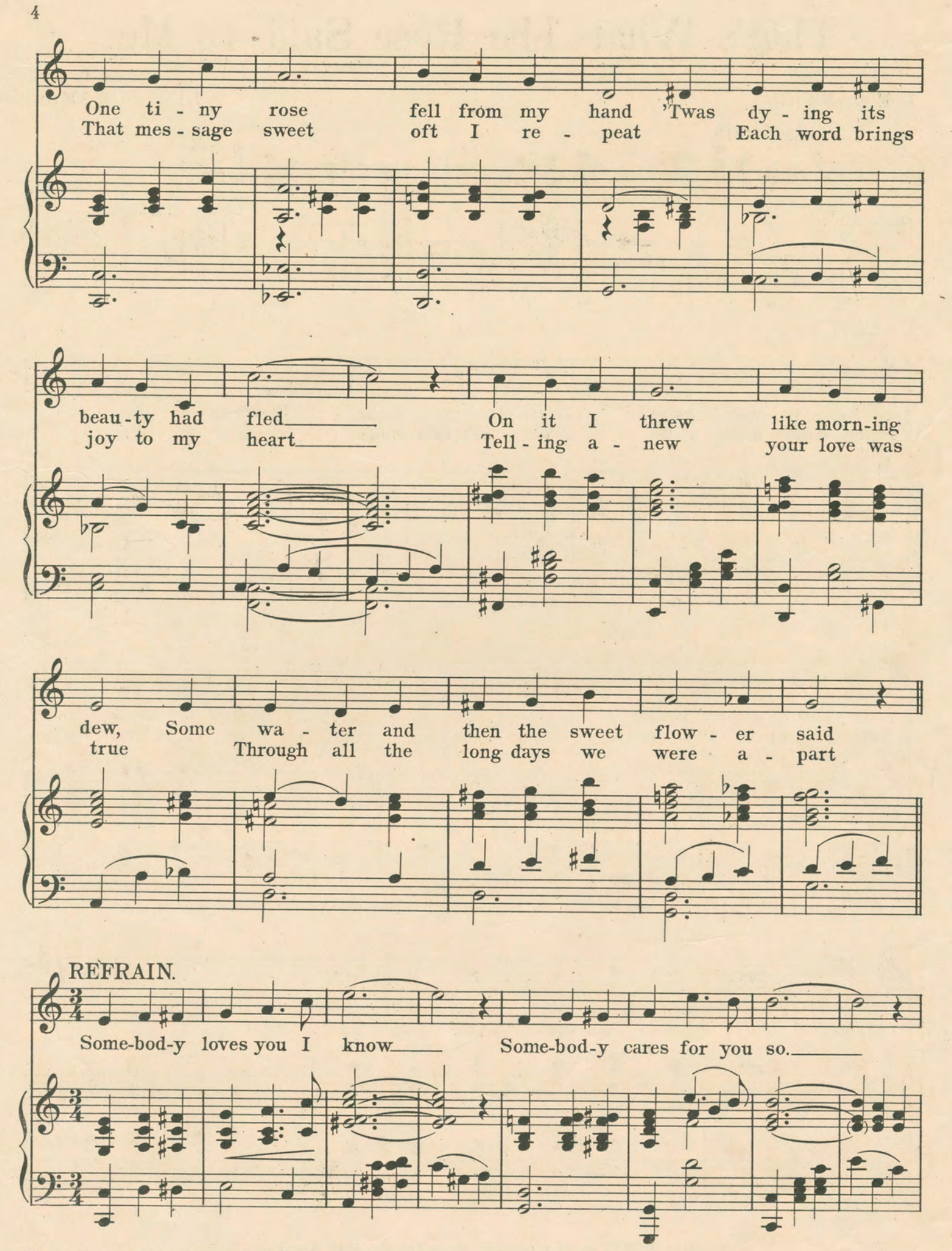
That's what the rose said to me. 3 Low.