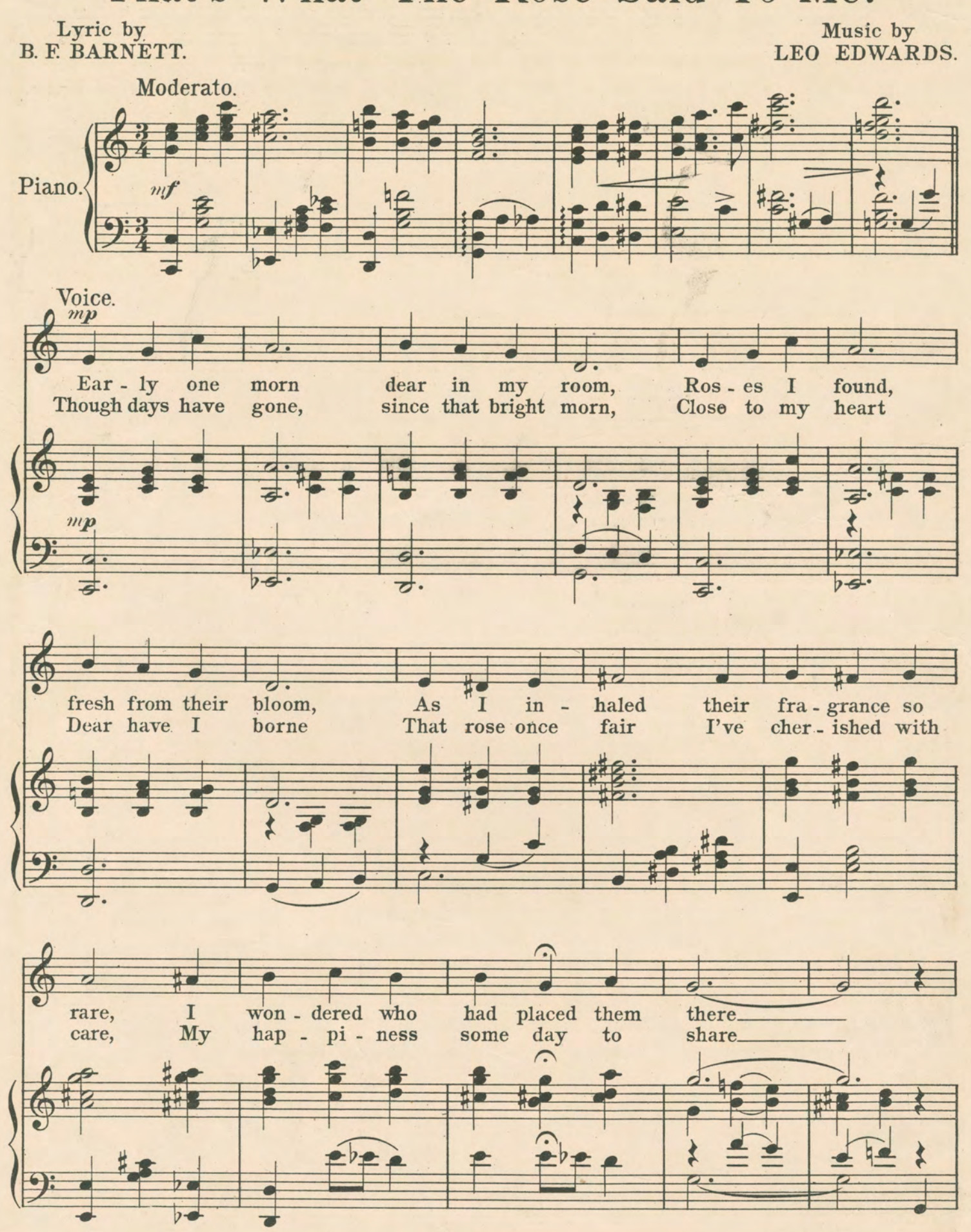
Copyright MCMVI by Gus Edwards Music Pub. Co. 1512 Broadway, N. Y. International Copyright Secured.