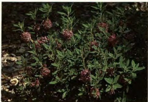
4 Sheep Laurel 'Hammonasset', p. 17