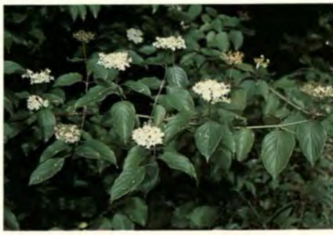
22 Silky Dogwood, p. 11