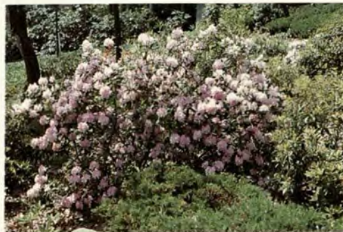
7 Carolina Rhododendron, p. 15