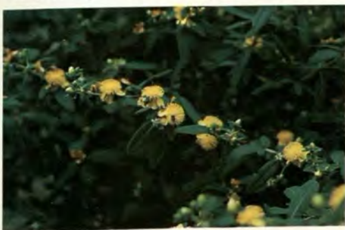
21 Shrubby St. Johnswort, p. 16