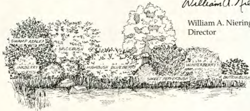
Native shrubs for water's edge or wetlands.