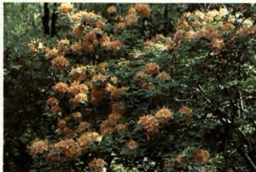
3 Flame Azalea, p. 8