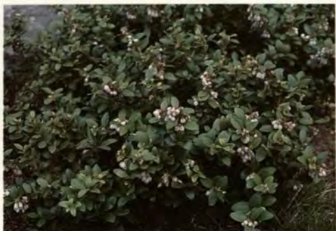
31 Box Huckleberry, p. 10