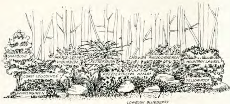
Native shrubs for shaded or partially shaded sites.

Visualizing the Mature Planting. There is a tendency to plant material too close together, to give the feeling of an instant mature landscape. If you are prepared to move plants to avoid overcrowding, this is fine, but if you wish to make a permanent planting plan, leave plenty of space between plants allowing for their mature size. Obviously, tall shrubs should not be planted in front of windows where the view will be blocked. Try to visualize what the planting will look like two decades from now. Will you like it? Will an important vista be cut off or will the plants be too crowded to show their distinctive landscape attributes? By planning ahead you will enjoy your landscape for many years.