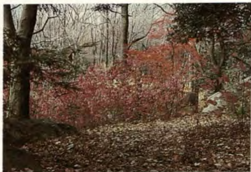
25 Maple-leaved Viburnum, p. 20