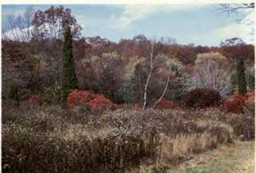
28 Naturalistic Landscaping Area, p. 4