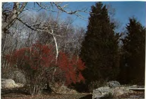
26 Winterberry, p. 21