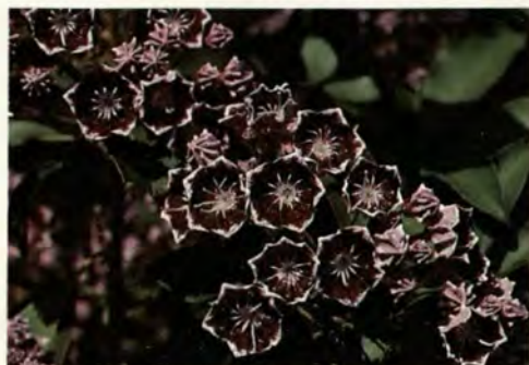
2 Mountain Laurel 'Goodrich', p. 13