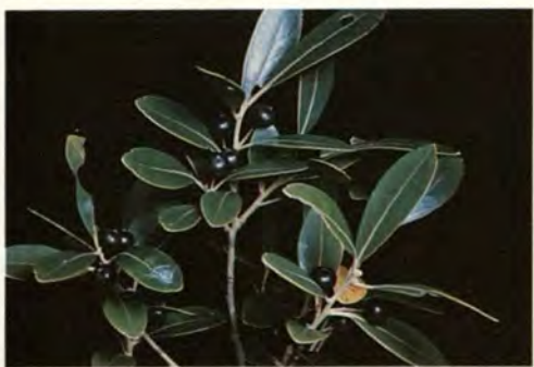
29 Inkberry, p. 12