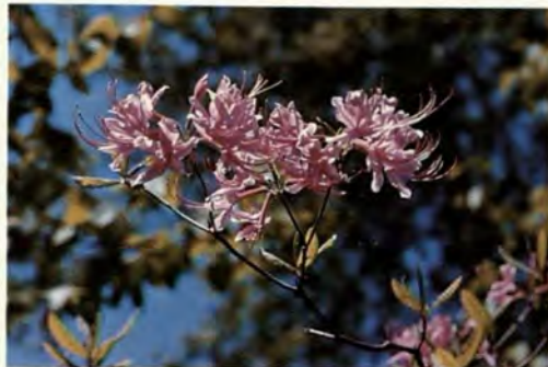
1 Pinxter Flower Azalea, p. 8