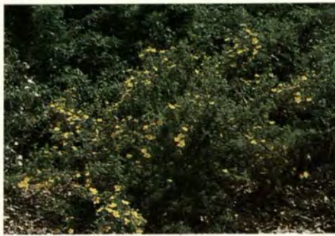
20 Shrubby Cinquefoil, p. 23