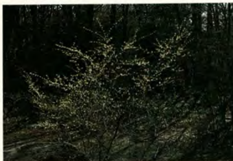
11 Spicebush, p. 17