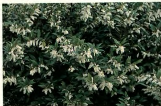
12 Coast Leucothoe, p. 13