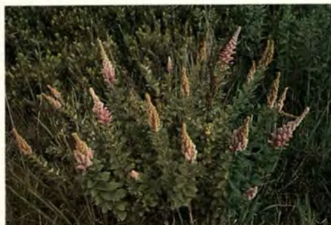
13 Steeplebush Spiraea, p. 18