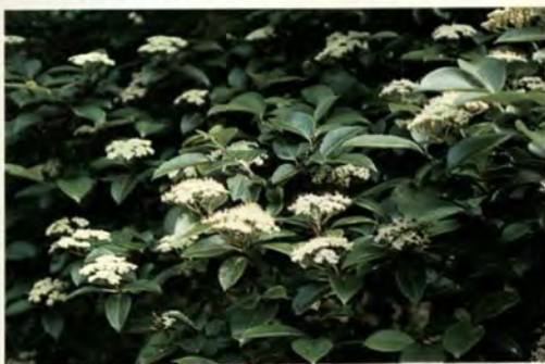
19 Witherod Viburnum, p. 20