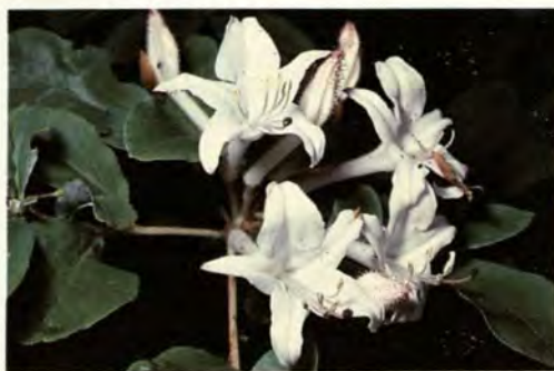
5 Swamp Azalea, p. 8