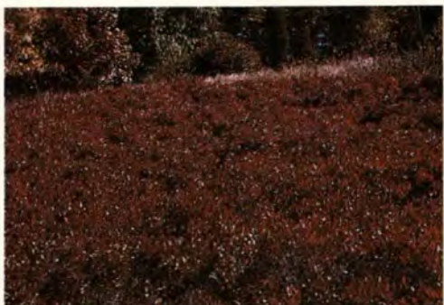
27 Black Huckleberry, p. 23