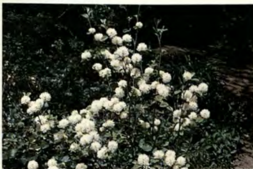
17 Fothergilla, p. 11