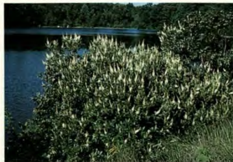
15 Sweet Pepperbush, p. 18