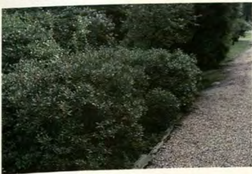
23 Bayberry, p. 9