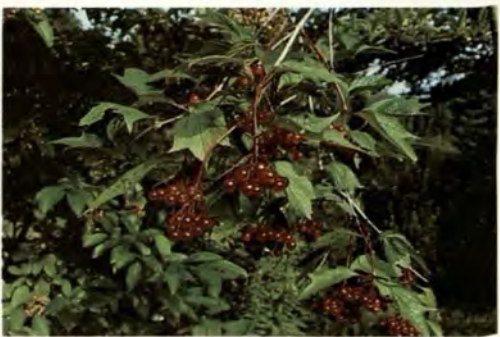
30 Cranberry Viburnum, p. 20