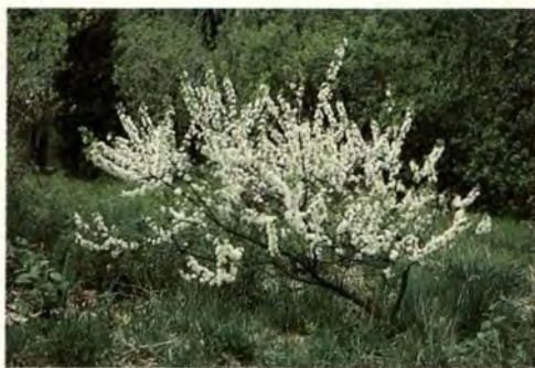
6 Beach Plum, p. 9