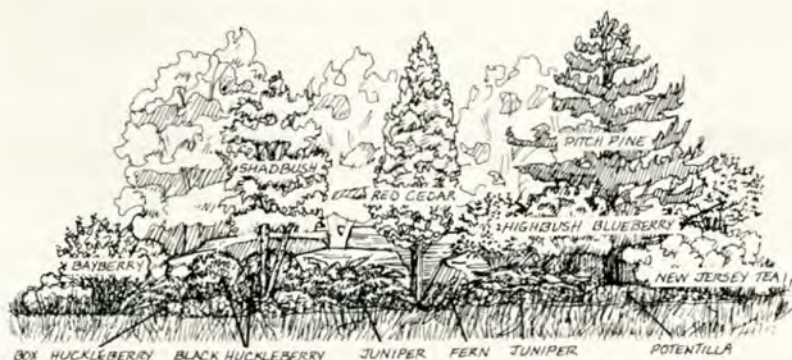
Native shrubs for dry, open, sunny sites.