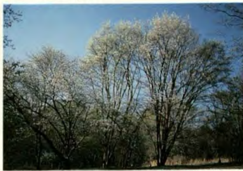
18 Serviceberry, p. 17