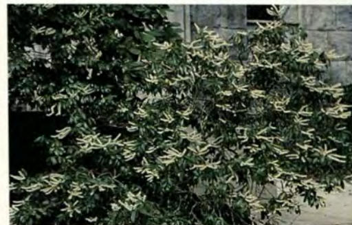
14 Mountain Andromeda, p. 22