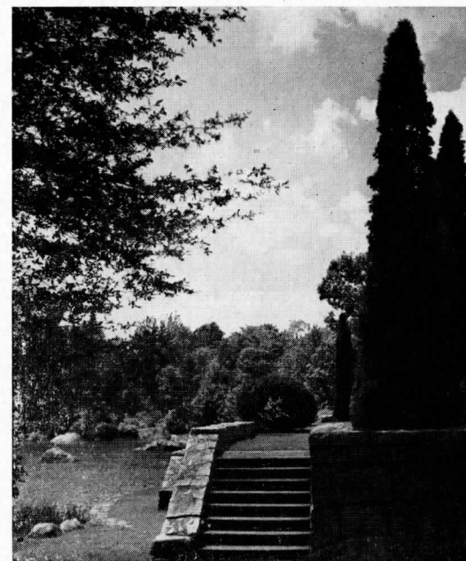
Stage Steps of the Outdoor Theatre.