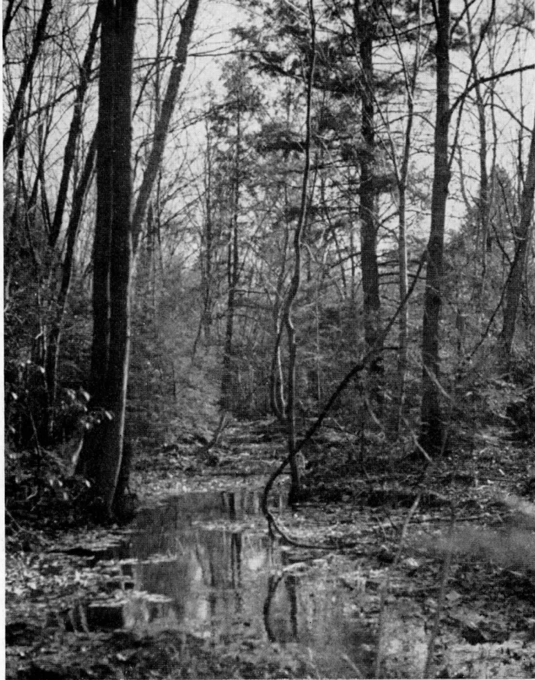
The Ravine, in the heart of the Natural Area.

Gallows Lane will be fenced in as soon as funds are available, in order to keep vandalism to a minimum. A good start has been made, as 2100 feet of galvanized fencing have already been purchased.