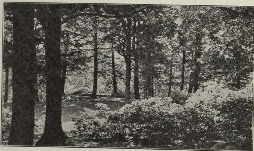
The Hemlock Grove in the Arboretum