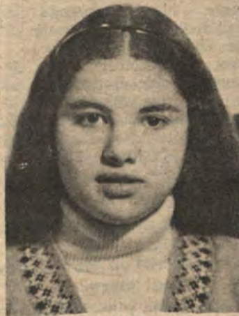
by Karen E. Frankian

The Honor Code must continue to exist at Connecticut College. Quite clearly a close examination is merited to see as to whether certain provisions in the Code should continue to exist. Regardless of the outcome of such an inquiry, for the Code to be viable and function effectively in this community all of us must agree to uphold its language and strive for its effective use in our community.