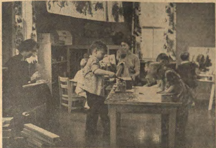
Connecticut Students Assisting at College Nursery School.

Education has become one of the prime concerns in the psychology conscious world of today, especially the primary education of very young children. In answer to the increasing demand for pre-school instruction and observation, a world-wide organization for nursery education has established an international basis for comparison and conference among pre-school educators. This organization has gone a long way toward promoting an understanding of the importance of nursery education and toward pointing out the value of such an education.