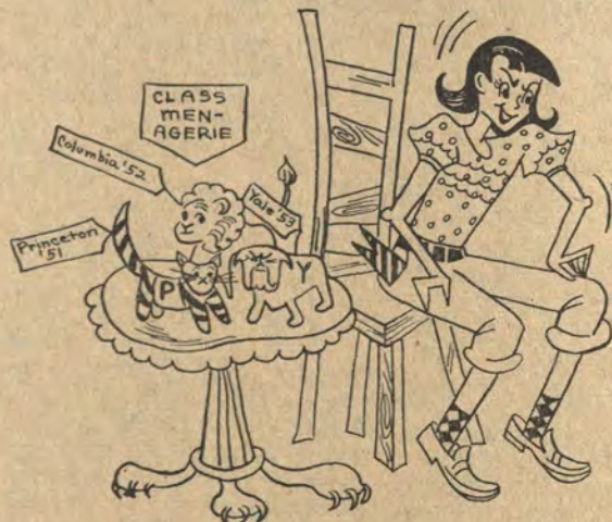
"Waiting For a Gentleman Caller"

man who is facistic in his tendencies in control in an area in which we are trying to inculcate democracy is a strange and dangerous inconsistency. President Truman deserves the thanks of all Americans. Let us hope that there are enough intelligent Americans who will not have their thinking clouded by personality issues and emotional attitudes to the extent that they are unable to perceive the real issues at stake in the MacArthur incident.