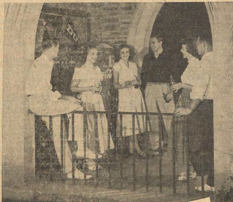
"Y" Duke University Durham, North Carolina