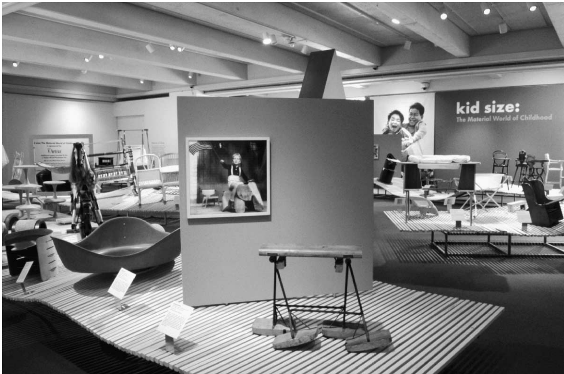
Fig. 1. Installation, Kid Size: The Material World of Childhood , Wadsworth Atheneum, Hartford, Conn.

2004) and Childhood: From Perambulators to PlayStation (at the Royal Pump House Museum, Harrogate in 2004–5). Somewhat comparable in scope is Archaeologies of Childhood: The First Years of Life in Roman Egypt , on display at the Kelsey Museum of Archaeology at the University of Michigan, 2003–4.