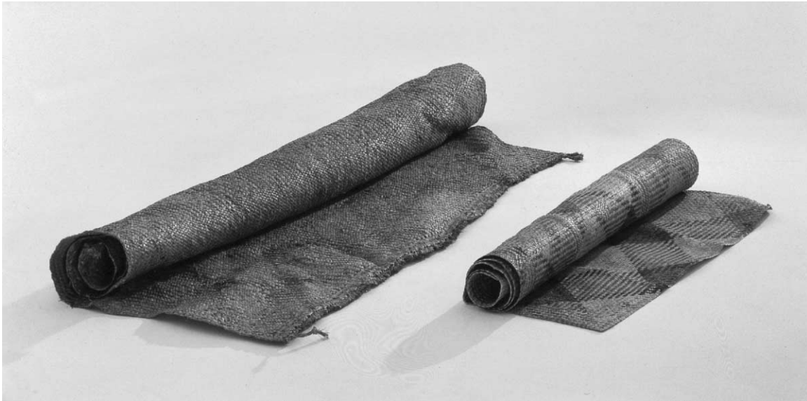
Fig. 4. Mat, Aibom, New Guinea, modern. Plant fiber. Sleeping mat, Timbuke, central Sepick, Papua New Guinea, modern. Bamboo fiber. (Museum der Kulturen, Basel.)

clear in the exhibition checklist (published in the catalogue), which provides dates for each of the European and Euro-American artifacts, even if only to identify the century in which it was made. In contrast, materials from Africa, Asia, Indonesia, India, and South America are not given dates; this is true even when the curators clearly know when an object was made, as in the case of a hook from New Guinea identified as the work of a fourteen-year-old boy named Kumbal. Divorced from their historical contexts, these objects are rendered timeless. Seemingly isolated from the forces of modernity—or any other social dynamic—they are transformed into static tokens of perpetually primitive cultures. The Wadsworth Atheneum curatorial staff is to be commended for determining dates for every piece in the exhibition and including that information on the labels. But even their attention to this important detail could not undo the fact that the exhibition uses so-called non-Western materials as exotic “Others” that re-center the viewer’s attention on the number and variety of objects used by European and American children.