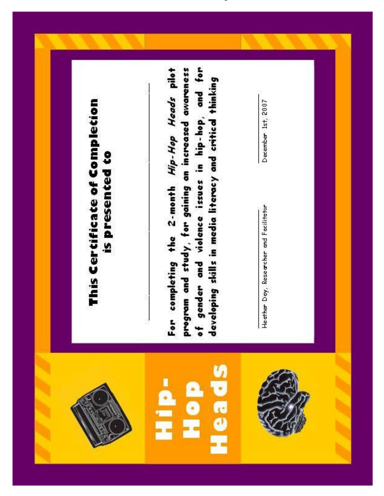
APPENDIX B: Certificate of Completion