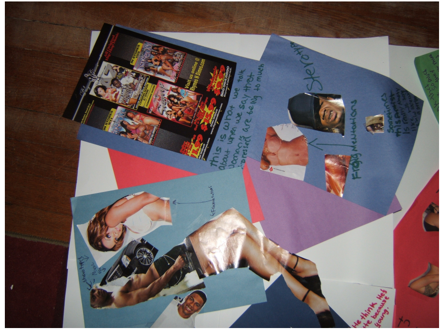
"Stereotypes" "Music Videos" "[fragmentations]" "this is what we talk about when we say that woman's are being [too] much expressed" "fragmentations" "[stereotypes]" "sometimes this rapper is really nasty like the song I'm in love with a stripper"