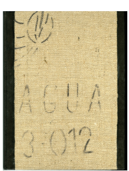
The cover of Cosas Perdidas was created from fine leather and a coffee sack.