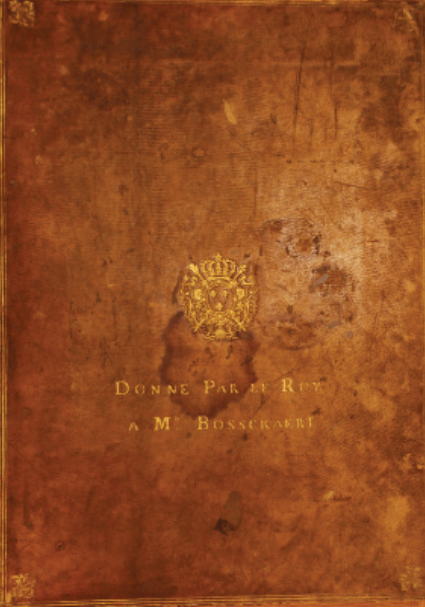
The gold-stamped cover of this collection of prints is evidence of a royal provenance.

A final volume is both extremely rare, if not unique, and has a royal provenance. A collection of plates bearing the simple title in French, Collection of Prints by Italian and French Masters from the Royal Academy of Painting and Sculpture, contains dozens of portraits of French artists dating from the early 17th to the late 18th century. Only one other book with a similar title could be found and it is located in the Bibliothèque Nationale de France in Paris. However, the Bibliothèque Nationale's copy contains pastoral and hunting scenes, making it clear that although the books are likely similarly composed collections, they are not identical. Our copy also has a gold stamped cover with the coat of arms of Louis XVIII of France (1814-1824), and the gold inscription, "Given by the King to Mr. Bossckaert." It is tempting to think that this might be a reference