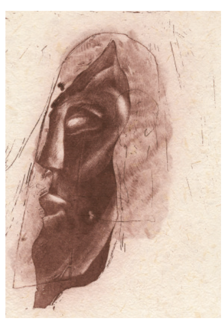
Engraving of a carved wooden head in an artisan's shop in Matagalpa, Nicaragua.

sacks as the cloth covering. We hope that the book will be of great use to students both the in arts and in Latin American studies. WOO_DEN\C·LOUD\S