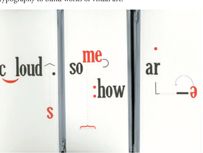
Three "pages" from Werner Pfeiffer's Woo_den\c·loud\s. One of the pages has been unzipped and can be reattached to any other part of the book.

Woo_den\c.loud\s consists of a poem in which each word is printed on a separate board. The individual boards can them be rearranged and attached by means of zippers. Pfeiffer's book invites readers to deconstruct and rearrange the words of a poem, creating new constructions of sense and nonsense. It is an experiment in the interchangeability of words and in the use of typography to build works of visual art.