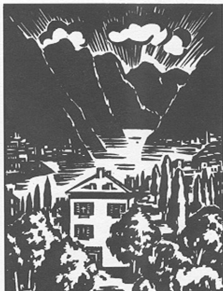
"Montagnola di Lugano" woodcut by Frans Masereel from The Officina Bodoni: The Operation of a Hand-press During the First Six Years of its Work Paris and New York, 1929