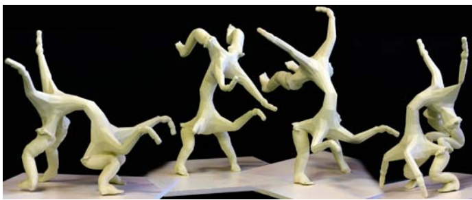
Maquettes for Putto 4 over 4 on display in the Shain Library.

http://www.michaelrees.com/Michael_Rees/home2.html