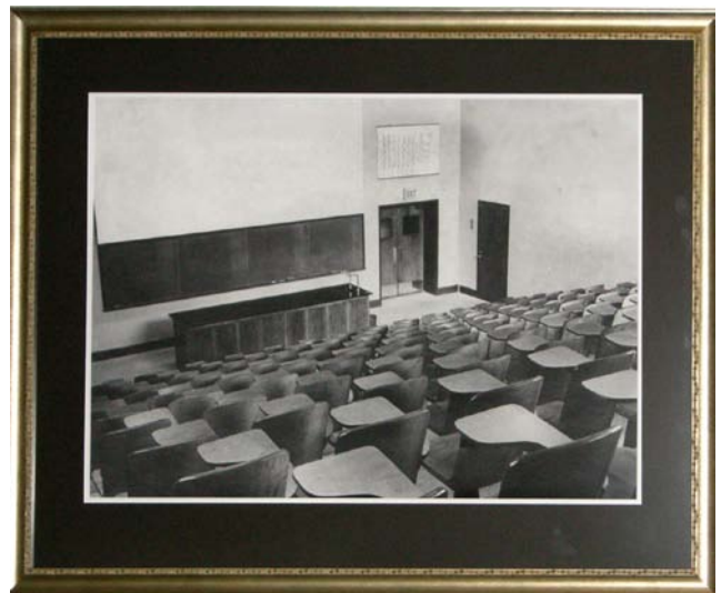
Original Bill 106 before renovation.