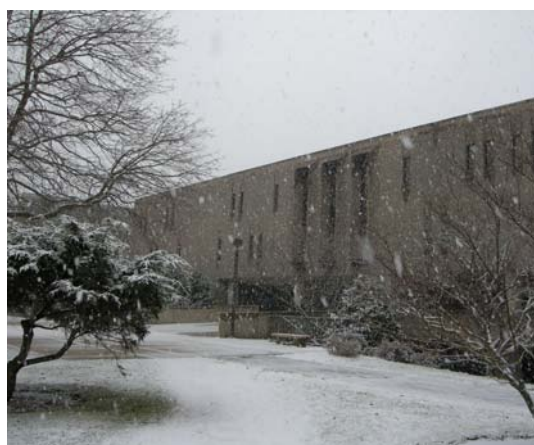
Winter snowstorm at the college.