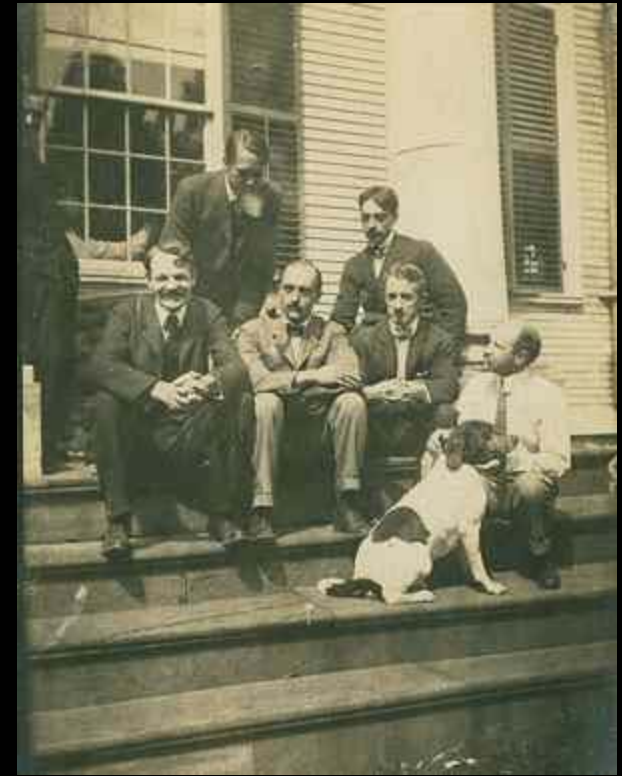
Above: a period photograph of artists on the steps of the house.

Located on Lyme Street, the building is now Old Lyme's most noted art museum as well as the headquarters of the Lyme Historical Society.