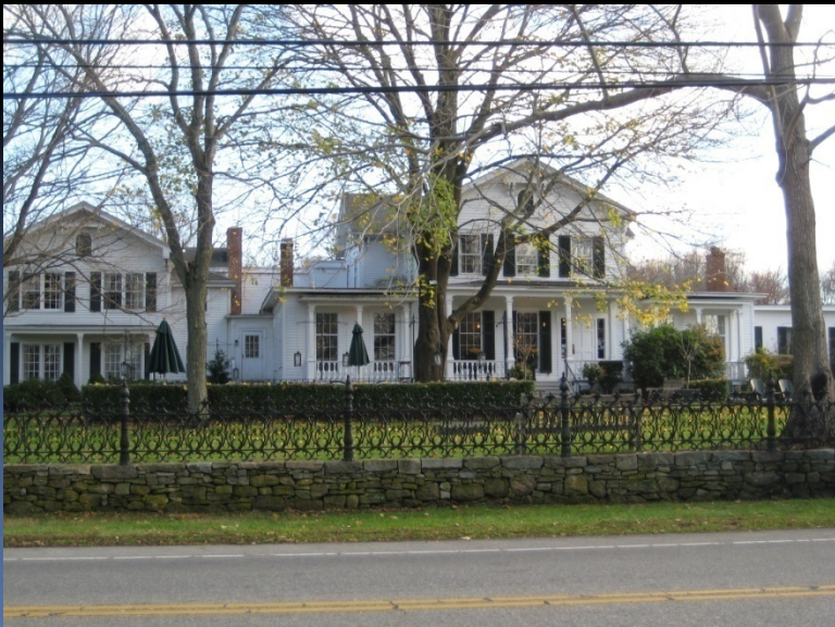
The two inns on Lyme St.

Lyme Street is comprised of traditional houses, churches, schools, the Town Hall, the Academy of Fine Arts, art galleries, two inns, a fire station, library, museum and small business establishments, all of which greatly contribute to the town's quaint ambiance.