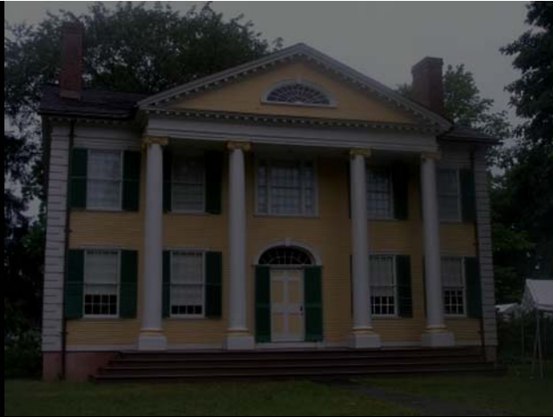
Below: View of the Griswold House (1908), by Harry Hoffman.