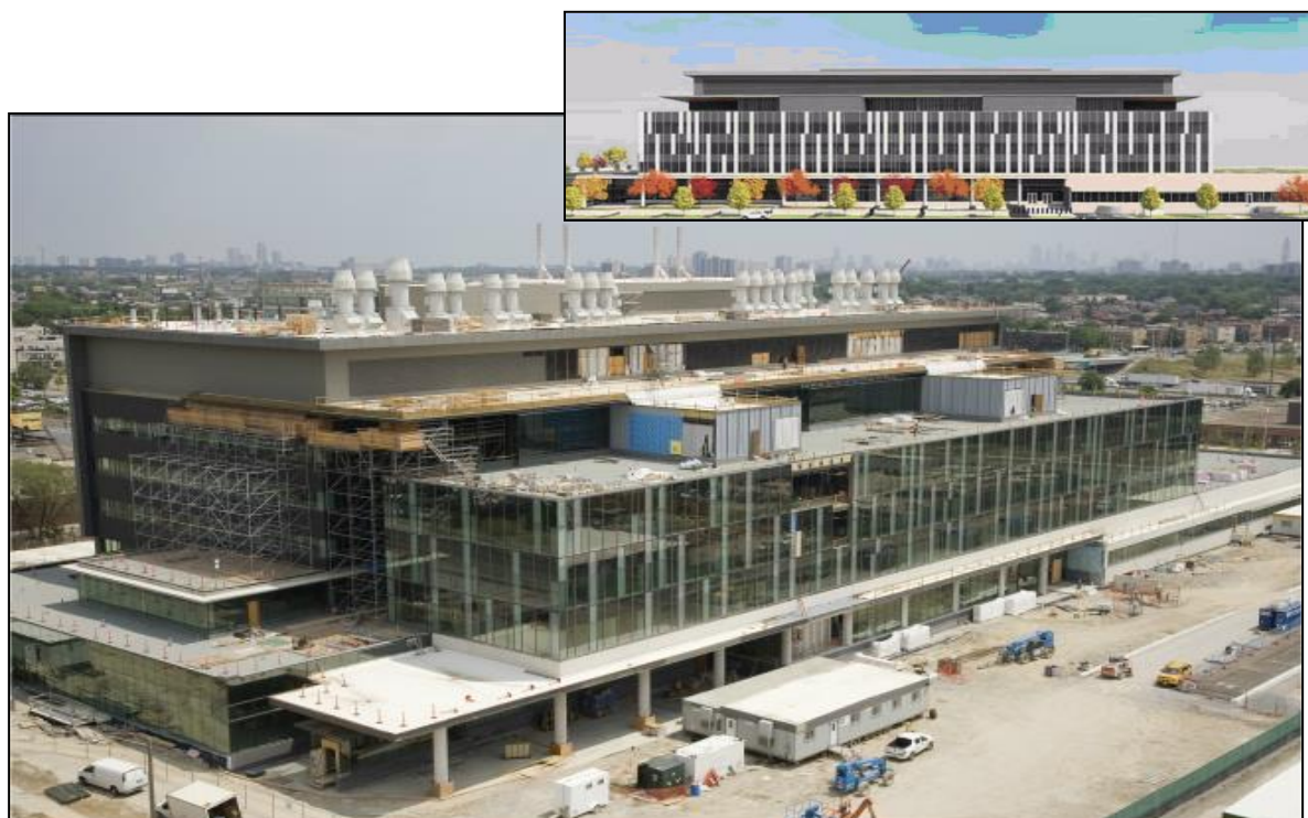
Forensic Services and Coroner's Complex under construction in Ontario (2012)

Gruspier asserts that scientific research that is 'forensically focused' is the only way to decrease analytical errors and that a dedicated forensic institute would be able to provide on-going education for justice system professionals. Such a facility is nearing completion in Ontario.